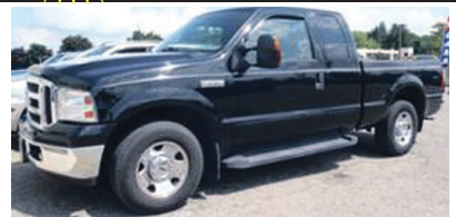
2006 F250 XLT, 5.4 V8, super cab. Loaded, alloys.