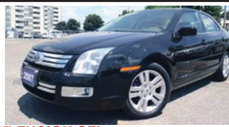
2007 FUSION SEL, V6, loaded, alloys, leather, keyless, very clean, 58,000 kms.