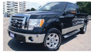
2009 F150 XLT 4x4 SUPER CAB XTR, loaded, one owner, very clean, Rhino liner, trailer tow.