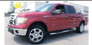
2009 F150 XLT 4x4, 5.4 V8 Super Crew, One Owner. Very clean. A must see. Fully Loaded.