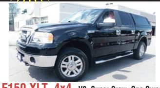
2008 F150 XLT, 4x4, V8, Super Crew, One Owner. Matching Cap, R/Camera. Very low kms.