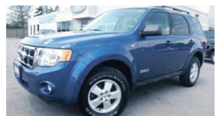
2008 ESCAPE XLT AWD, loaded, alloys, keyless, one owner, very clean.