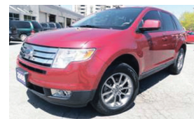
2008 EDGE SEL AWD, dvd for the kids! Loaded, one owner. Very clean.