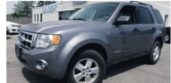
2008 ESCAPE XLT, FWD., V6. Loaded, leather.