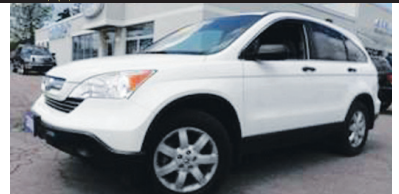
2009 CRV EX, auto, loaded, moonroof, alloys, one owner.