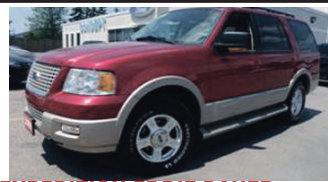
2006 EXPEDITION EDDIE BAUER, leather, very clean, one owner.