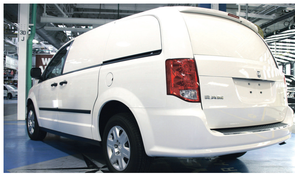
The first Ram Cargo Van is shown coming off the assembly line in Windsor.