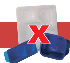
Plastic "lunchable" containers and snack packs