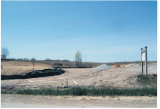
GLEN WILLIAMS LOT-BUILD YOUR DREAM $325,000 Iris Irwin* 11-187-VL W209406