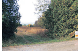
BUILD YOUR DREAM $220,000 Mary Maan*/Emma Fedor* 11-315-VL X2150192