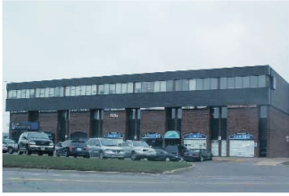
RENTAL UNIT AVAILABLE $13.00/sq.ft. PresswoodTeam.com 10-343-30 W2074085