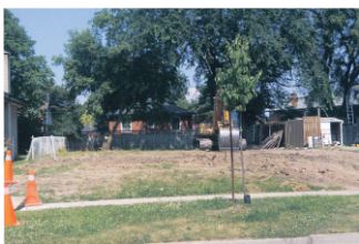
BUILD YOUR DREAM! $229,000 Chris* & Lee Gonchar* 11-302-VL W2143027