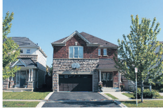
GREAT FAMILY HOME - STEWARTS MILL $499,900 PresswoodTeam.com 11-254-30 W2124351