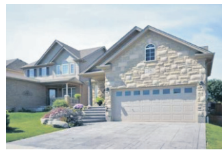
COUNTLESS UPGRADES! $475,000 latamandlatam.com 11-310-99 X2144618