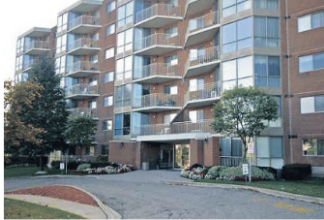
6 MONTHS CONDO FEES - FREE! $239,900 haltonhomes.com 11-158-30 W2086203