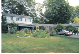
OVER 1/2 ACRE BACKING ONTO RIVER $695,000 PresswoodTeam.com 11-346-30 W2167065