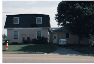
IN-LAW SUITE WITH SHOP $350,000 latamandlatam.com 11-141-91 X2162295