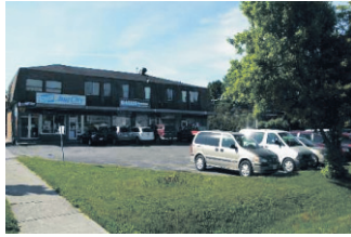
3 OFFICES IN GREAT LOCATION $11.00/SQ.FT. briansnow.org W2143340/W2143318/W2143338 11-305-90