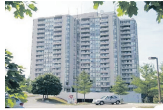
1200 SQ.FT. CORNER UNIT $295,500 stevejenkins.ca 11-210-30 W2119910