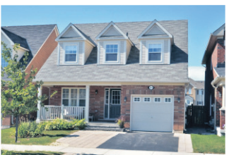
CHARMING CAPE COD STYLE IN MILTON $464,900 haltonhomes.com 11-385-99 W2180934