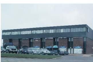
RENTAL UNIT AVAILABLE $13.00/sq.ft. PresswoodTeam.com