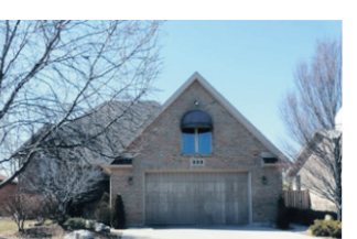
OVER 3,000 SQ FT OF LIVING SPACE $304,900 Sue Coulligan*