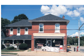
HIGH TRAFFIC CORNER $1,500/MONTH PresswoodTeam.com