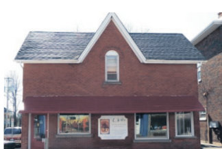
FANTASTIC LOCATION FOR A FLOWER/GIFT SHOP $700/Month David Burland*