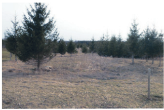
VACANT BUILDING LOT - MINS TO ACTON $249,000 stevejenkins.ca

It's easy for you to make good Real Estate decisions backed by your Johnson Associates agent's local knowledge and expertise.