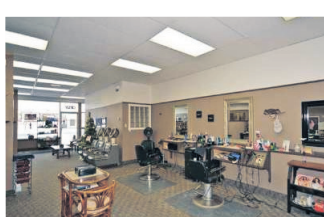
WELL ESTABLISHED BUSINESS-PRIME LOCATION $75,000 briansnow.org