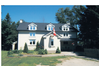
1867 SCHOOLHOUSE W/MODERN FLARE $429,900 Iris Irwin*