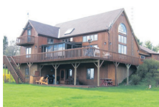
NESTLED ON 11.46 ACRES - GREAT VIEWS $875,000 Jodie McGucken*