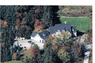
COUNTRY ACRES ... NEWER HOME W/POOL $1,350,000 Jill Johnson*