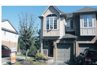
3 BEDROOM EXECUTIVE TOWNHOME $305,000 briansnow.org