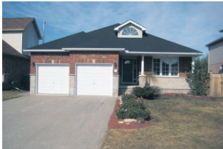
COMPLETELY ACCESSIBLE 2 BDRM BUNGALOW $425,000 latamandlatam.com