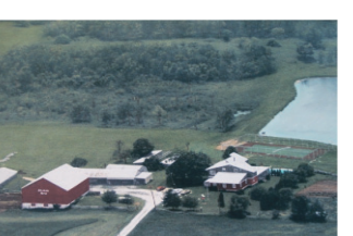
103 ACRE FARM ON ROLLING LAND $825,000 Julia Stuart*