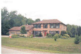
APPROX. 2800 SQ FT ON VERY PRETTY 2+ AC $659,900 Jill Johnson*