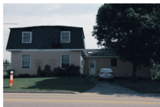
IN-LAW SUITE WITH SHOP $350,000 latamandlatam.com