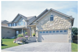
COUNTLESS UPGRADES! $475,000 latamandlatam.com