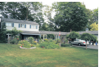
OVER 1/2 ACRE BACKING ONTO RIVER $695,000 PresswoodTeam.com