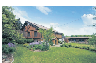
"LOFT HOUSE" FOR SALE $969,000 Kathy Ellis*