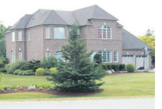
QUIET ELEGANCE WITH GOLF COURSE VIEWS $1,099,000 Iris Irwin*