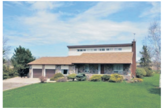
LOCATION! LOCATION PLUS NATURAL GAS $595,000 Anna Lostritto*