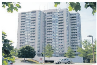
1200 SQ.FT. CORNER UNIT $295,500 stevejenkins.ca