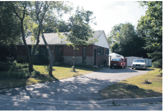
3+1 BEDROOM BUNGALOW ON CORNER LOT $374,000 Chris*/Lee Gonchar*