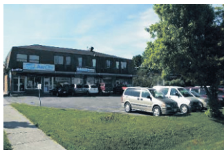
3 OFFICES IN GREAT LOCATION $11.00/SQ.FT. briansnow.org