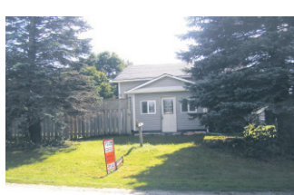
THREE BEDROOM CHARMER $234,900 Elizabeth Doell*