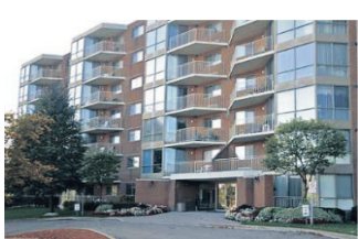
6 MONTHS CONDO FEES - FREE! $239,900 haltonhomes.com