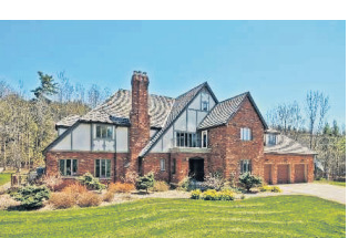
CUSTOM BUILT HOME-3.6 ACRES IN THE GLEN $1,299,000 Iris Irwin*