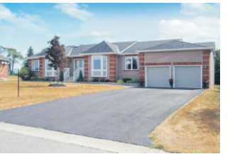
BEAUTIFUL BUNGALOW ON QUIET COURT $629,900 Peter Zavitz*