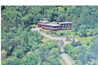
TEXT - Janicer4 to 63636 For More Info & Photos $1,186,000 Janice Rumley*