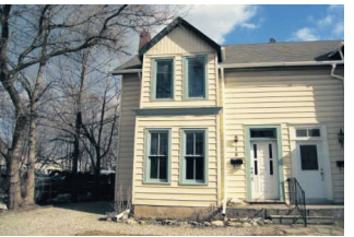
TAKE A LOOK AT THE VIRTUAL TOUR! $259,900 haltonhomes.com