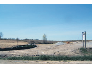
GLEN WILLIAMS LOT-BUILD YOUR DREAM $325,000 Iris Irwin*