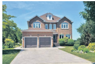
BACKS ONTO THE RAVINE W/INGROUND POOL! $869,900 Bill*/Lia McNally*