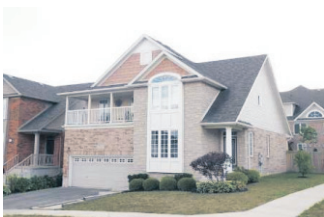
EXECUTIVE HOME-PRIME WATERLOO LOCATION $429,900 haltonhomes.com