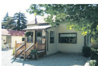
LARGE LOT, PRIVATE MATURE SETTING $284,900 Iris Irwin*