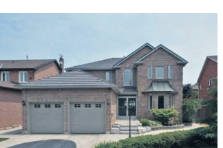
SHOWSTOPPER ON DONAGHEDY $699,500 Iris Irwin*