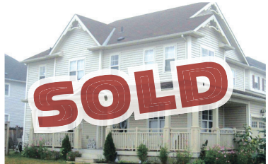
37 SOMERVILLE RD., ACTON SOLD by

Another home to choose from in Acton's Honeyfield neighbourhood! Lots of curb appeal w/old fashioned front porch! • Large, fenced backyard w/ mature trees • Open Concept • Big Kitchen w/ breakfast bar & cherry coloured cabinets • Servery w/ extra cupboard & counter space makes an ideal bar or buffet area for entertaining! • 4 Bedrooms • Master Bedroom w/ his & hers walk-in closets • Ensuite has corner soaker tub & separate shower • Tasteful, neutral colours & finishes throughout the home • Parking for 4 cars! $448,900 See the pictures at www.WillSell.ca