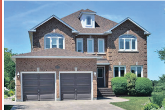
53 SAMUEL CRES., GEORGETOWN THE BEST LOT IN GEORGETOWN SOUTH? WE THINK SO!

Breathtaking views of the ravine! • No neighbours behind! • Huge pie shaped lot • In-ground pool, stamped concrete patio & cottage style garden shed • 3000 sq ft home is ideal for entertaining • Kitchen has island & more cupboards & counter space than you'll ever need! • Main flr den • Gas fireplace • 4 Bedrooms- 2 with ensuites. Master Bedroom is amazing! Walk out to balcony offering bird's eye view of the ravine! 5 piece ensuite is luxurious & has double sinks & soaker tub w/bay window. $869,900 Virtual tour at WillSell.ca