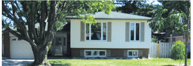
9 ROSEMARY RD., ACTON COMING SOON

Great starter home! Well maintained with pleasing, neutral colours & finishes • Open concept main flr with laminate • Inside access to garage • Powder room close to entrance • Walk-out to spacious, shaded deck- no neighbours behind you! • Double doors lead to master bdrm w/ walk-in closet • Ensuite has deep, whirlpool tub • Quality Berber carpeting is in great shape. Finished bsmt offers extra living space & is bright with above grade windows & walk-out to backyard $269,900 Virtual tour at www.WillSell.ca