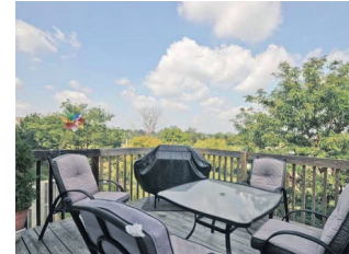
15 COREY CIRCLE, GEORGETOWN 3 BEDROOM END UNIT TOWNHOUSE

Great starter home! Well maintained with pleasing, neutral colours & finishes • Open concept main flr with laminate • Inside access to garage • Powder room close to entrance • Walk-out to spacious, shaded deck- no neighbours behind you! • Double doors lead to master bdrm w/ walk-in closet • Ensuite has deep, whirlpool tub • Quality Berber carpeting is in great shape. Finished bsmt offers extra living space & is bright with above grade windows & walk-out to backyard $269,900 Virtual tour at www.WillSell.ca