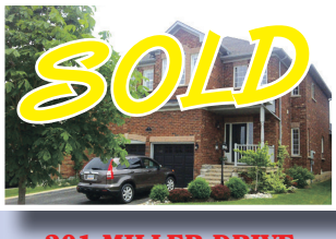
201 MILLER DRIVE

VACANT LAND CENTRALLY LOCATED IN GEORGETOWN Walking distance to schools, shops, banks and restaurants. Generous size, 50 x 109 sq ft fully serviced lot. No development fees for a huge savings. Grading and survey plan 2011 are available. $229,000.