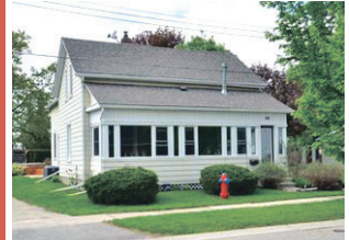
87 LAKE AVE., ACTON DOUBLE LOT OVERLOOKING FAIRY LAKE!

Completely renovated 3 bdrm home - oversize foyer makes great impression w/porcelain tiles & beautiful door w/sidelights • Large, newer kit. looks amazing! Pot drawers, 2 pantries & office area which is great for helping the kids with homework while you prepare dinner! • Bsmt features large rec room with great quality laminate (looks like the real thing), 2nd full bathroom & pot lights • Unfinished area would make a storage area of play room (the kids can play hockey w/foam pucks!) • Backyard is fully fenced & quite private with mature trees. Parking for 5 cars! Will be on the market soon. $359,900 Call Bill McNally for more details!