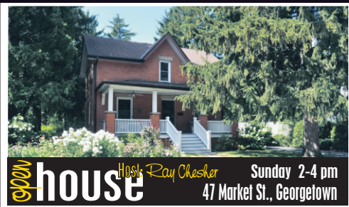
house Host: Ray Chesher Sunday 2-4 pm 47 Market St., Georgetown The One You've Been Waiting For! The charming front veranda welcomes you to this lovingly restored 3 bdrm, 1.5 bath Victorian red brick in the heart of Georgetown's much sought after Park Area. English perennial gardens and majestic spruce trees line this impressive 66' x 132' lot located just minutes to schools, parks & Historic Downtown with restaurants, shops, library & Farmer's Market. Stunning custom Cherrywood Artcraft Kitchen, formal Living Room & Dining Room both with Oak hardwood floors, large windows & gas fireplaces. Large dual-level back deck is perfect for entertaining! Bonus - Double detached Garage with Loft and parking for 6+ vehicles! $524,900.00 Georgetown MLS# W2181828