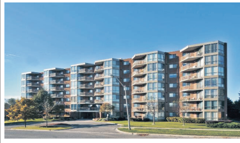
Gorgeous Penthouse Suite! Located on the edge of Georgetown in the Royal Ascot, this suite offers approximately 1,200 sq. ft. of sun-drenched living space including Living and Dining areas with floor-to-ceiling windows - tons of natural light! The Kitchen offers great cabinet and counter space. Lovely Master bedroom has huge walk-through closet with built-in shelving and 4 piece ensuite with Jacuzzi tub. 2nd bedroom is bright and spacious! Parking space is located closest to the elevator for added convenience. This well maintained condominium building offers exercise room, party room, billiards room, library, extensive gardens and great BBQ area! $243,000.00 Georgetown MLS# W2130802