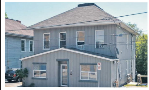
Wall to Wall Income! 5 unit rental property is in the perfect location, close to schools, parks & Go Transit! Upper level apartments (2x2bdrms) are well maintained and have been renovated - 1 has long term tenant. The apartments on the main level (2x2 bdrms) and basement unit (1x3 bdrm) require renovations. $445,000.00 Georgetown MLS# W2124526