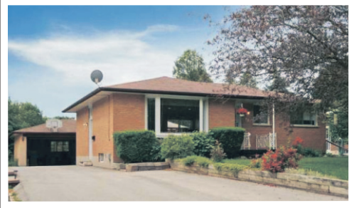
Great Location! This gorgeous 2+1 bedroom, 2 bath home is located in a friendly neighbourhood close to schools, parks & Historic Downtown with restaurants, shops & library. Extensively renovated with stunning Eat-in Kitchen with granite counters, stainless steel appliances & walkout to deck and fully fenced backyard. Bright Living Room has lovely laminate floors & large bay window. 2 main level bedrooms - both with hardwood floors and good closet space - share the main 4 piece bathroom. Finished Basement offers 3rd bedroom, Rec Room with gas fireplace, 3 piece bath & large Laundry/Utility Room. Great curb appeal PLUS 2.5 car Garage, 200 amp service & parking for 10 cars! $419,900.00 Georgetown MLS# W2139080