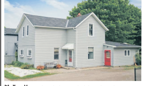
It's Your Move This 3 bedroom, 2 bath home located in Erin just a short walk to downtown shops. Main level features a large eat in Kitchen with oak cabinets and a center island. Spacious Living Room, Laundry/Mud Room and a 4 pce bath. Upstairs, the Master and 2 other bedrooms share a 3 pce bath. Bonus - Hot Tub room. $284,900.00 Erin MLS# X2122115