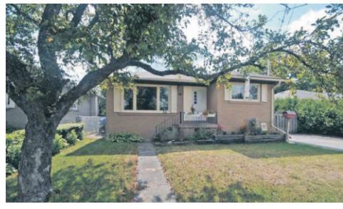
Even Little Legs can walk to Harrison Public School from this 3 bedroom, 2 bath bungalow located on a beautiful lot on a quiet crescent. Bright open concept Living/Dining Room combo with gleaming Hardwood Flooring and large picture window. The Kitchen has great work space and lots of natural light. Spacious Master Bedroom and the 2 other bedrooms all with Hardwood Flooring, share the main 4 piece bath with Jacuzzi tub. The finished lower level has a Rec Room with Wood Burning Fireplace - great for those cool evenings, 3 piece bath, laundry, extra storage and a workshop area. Private, fenced backyard has a patio area and 16 x 11 garden shed with great storage space for all your gardening tools. $329,900.00 Georgetown MLS# W2170763