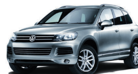
Touareg TDI Clean Diesel