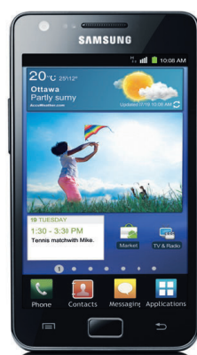
Samsung Galaxy S II™ 4G

3-yr. term No term $169 95 $599 95 SAVE $430