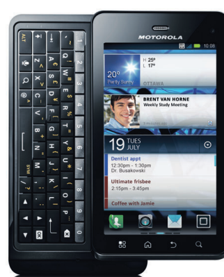
MOTOROLA XT860 4G

3-yr. term No term $99 95 $549 95 SAVE $450