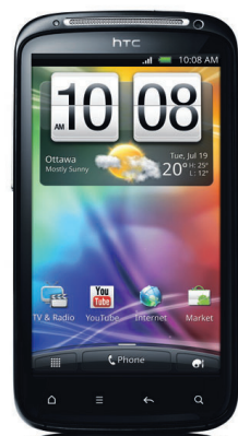
HTC Sensation™ 4G

3-yr. term No term $99 95 $549 95 SAVE $450