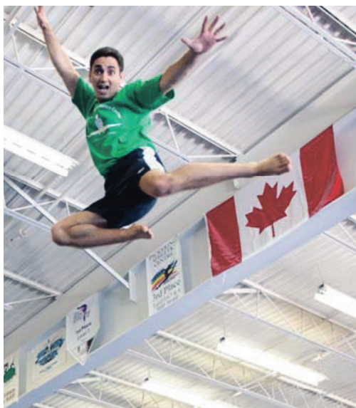
Expert international and national coaches