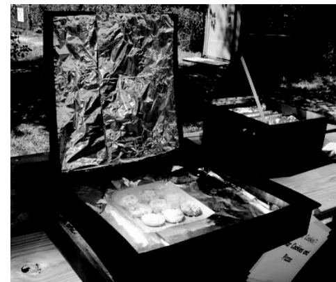
An example of a solar oven.

Categories for competition include: • Easiest set up to start cooking. (Judging from 2-2:30 p.m.) • Highest temperature reached. (Judging at 2:30 p.m.) • Most creative food item cooked