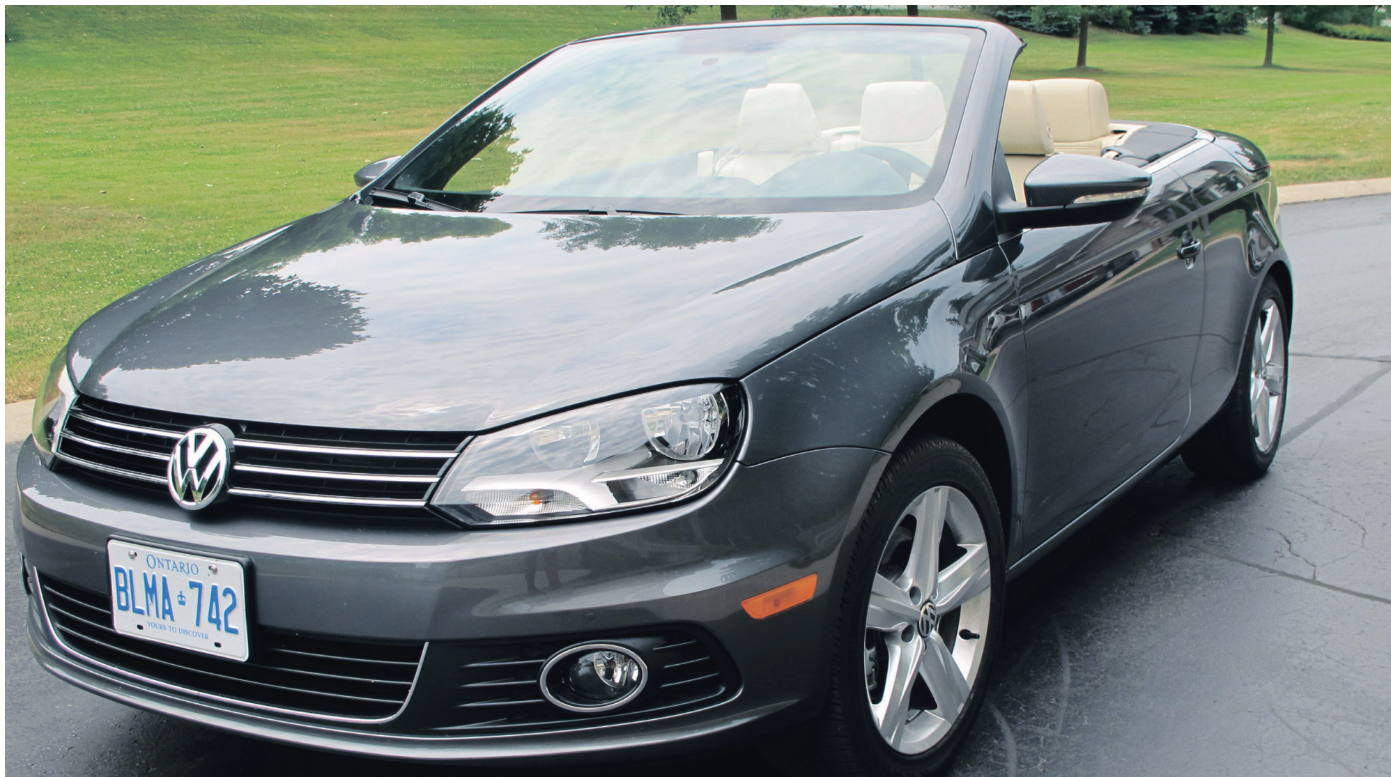
The 2012 Volkswagen Eos is one of the new breed of retractable hardtops that are taking over the convertible market. It has undergone its first redesign in 2012.