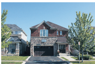
GREAT FAMILY HOME $499,900 PresswoodTeam.com 11-254-30 W2124351