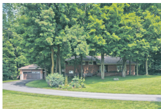
3.5 ACRES OF COUNTRY AMBIANCE $749,900 haltonhomes.com 11-299-60 W2141982