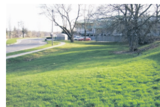
WHAT A DEAL THIS PROPERTY IS! $95,000 David Burland* 09-081-VL W2162233