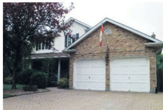
FONTHILL $469,000 stevejenkins.ca 11-211-99 X2110785