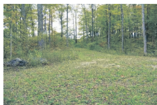
PRETTY TREED 2 ACRE LOT $89,000 Kathy Ellis* 11-039-VL X2032628