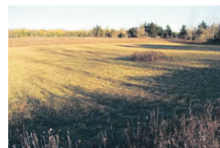
PRETTY 3.9 ACRE LOT WITH WESTERLY VIEWS $249,000 Iris Irwin* 10-468-VL X1997625