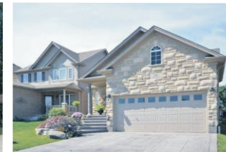
CAN'T BUY THIS QUALITY FROM THE BUILDER $475,000 latamandlatam.com 11-310-99 X2144618