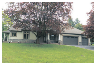
A RIVER RUNS THROUGH IT $1,295,000 PresswoodTeam.com 11-247-30 W2123218