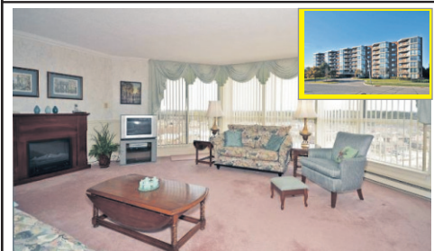
Gorgeous Penthouse Suite in the Royal Ascot, approximately 1,200 sq.ft. Large foyer with closet. The Kitchen has lots of cabinets & counter space. Floor to ceiling windows in the Living & Dining areas. Mstr Bdrm has a walk thru closet and a 4 pce ensuite with Jacuzzi. 2nd Bdrm is spacious and bright! Parking space is closest to the elevator. $243,000.00 Georgetown MLS# W2130802