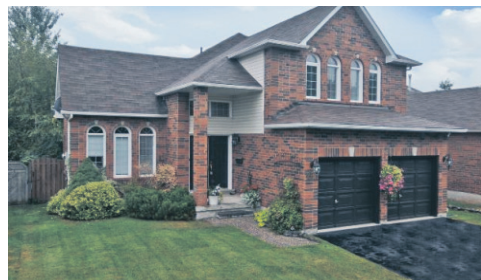
Even Little Legs can walk to the elementary school and park from this 3 bedroom, 4 bath home located on a quiet street with well kept homes and friendly neighbours. The open concept main level has Hardwood Floors throughout and features a Living Room with cathedral ceiling, Dining Room, generous Family Room overlooking Kitchen with granite counters, breakfast bar and walkout to a huge tired deck with built in planters and private, fully fenced backyard. The large master bedroom has a walk-in closet and 5 piece ensuite with soaker tub, double vanity and separate shower. The other 2 bedrooms share the main 4 piece bathroom. Finished basement with Rec Room and 2 piece bathroom. $499,900.00 Georgetown MLS# W2164289