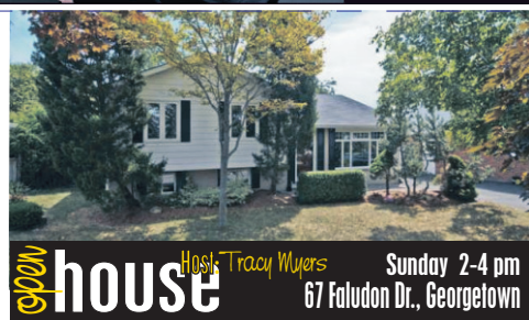
house Host Tracy Myers Sunday 2-4 pm 67 Faludon Dr., Georgetown Don't Dilly Dally! This 3 bedroom, 2 bath updated side split in a friendly area of Georgetown won't last long! Spacious Living Room with Berber, picture window and lots of natural light. The updated Kitchen comes with stainless steel appliances, great work space and breakfast bar. Huge Family Room is perfect for entertaining with cathedral ceiling, large windows and walkout to patio and private fully fenced back yard. The bright Master Bedroom has a sitting room that over looks the Family Room and semi-ensuite access to the main 4 piece bath - shared by 2 other good sized bedrooms. Downstairs, you will find a Rec Room with wet bar, wood burning fire place & 2 piece powder room. $389,900.00 Georgetown MLS# W2166739