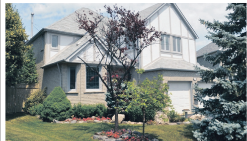
Butler Not Included! With this 3300 sq ft, 4 bedroom, 4 bath home in Georgetown South, set back from the quiet street and guarded by stately trees on a fully fenced premium pool sized lot - 44' front, 82' back by 119' deep - it projects an aura of permanence & quality. You will love the dark hardwood floors, updated Kitchen with granite counters, pot lights & amazing storage. Unwind in the Conservatory or entertain in the formal Living & Dining Rooms. Sun drenched Family Room with walk out to backyard. The Master Bedroom has a gorgeous "spa" ensuite & 3 other spacious bedrooms share 5 piece bath. Basement is finished with large Rec Room & Games area. A proper residence for gracious living! $718,888.00 Georgetown MLS# W2147026