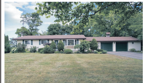
Those Little Extras are what make this 3 bedroom, 2 bath bungalow the perfect home for your family. For the handy man, an oversized garage. Great work space - Eat-in Kitchen with W/O through garden doors to huge deck, gazebo and lovely backyard. Living Room with large bay window, spacious F/R with lots of natural light. $484,900.00 Georgetown MLS# W2170108