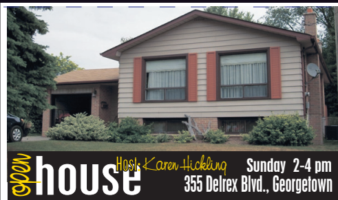
house Host Karen Hickling Sunday 2-4 pm 355 Delrex Blvd., Georgetown Another World... This quiet neighborhood of well kept homes, manicured lawns and friendly neighbors can provide you with a way of life you might have thought had disappeared. This solid 3 + 1 bedroom, 2 bath home with garage and breezeway, full finished basement with above grade windows and Gas Fireplace, fully fenced 50' x 150' lot with mature trees backing onto the park, tennis courts and play center is as pleasant inside as it appears from the street. Lots of updates - Roof ~ 2006, Furnace ~ 2009, C/A ~ 2010, Attic Insulated ~ 2010, Crawl Space insulated ~ 2010 and Carpet in Rec Room ~ 2010. Be the first to view this home and be the "New" owner! $399,900.00 Georgetown MLS# NEW