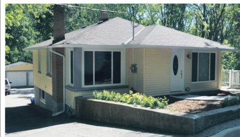
Country Setting - Downtown Georgetown Tall trees furnish a screen of privacy around this ~1/2 acre property-with the gentle sounds of the river! Set in the midst of this serenity is a gorgeous bungalow that enjoys nature's vistas from every room. The renovated 3 bedroom (can be reconfigured back to 4 bedroom), 2 bath home is designed for comfortable living and has all the amenities one could wish for, including a gorgeous eat-in Kitchen, formal Living/Dining, home office, finished W/O basement (possible inlaw suite), and detached double garage. Just a short walk to downtown Georgetown, shops, restaurants, parks & theater. If there ever was a "must see" this is it! $479,900.00 Georgetown MLS# W2167053