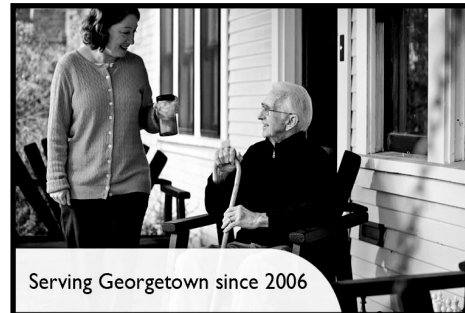
Serving Georgetown since 2006

R.R. 2, Guelph 519-856-4622 www.edenhousecarehome.ca