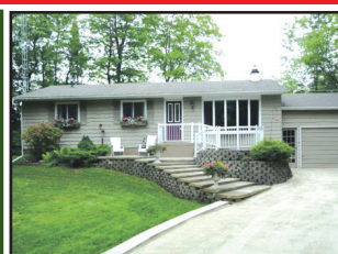
HOME FOR TWO+

WORK FROM HOME You'll find lots of space for family and entertaining in this 2300 sq. ft. home finished top to bottom. 50 year metal shingles, newly renovated kitchen, 10 year old addition for master bedroom & ensuite, 2006 double car garage, pool with deck, ++ 2300 sq. ft. detached workshop with 14' door. $797,000