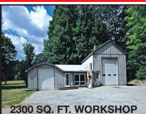
2300 SQ. FT. WORKSHOP