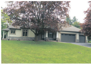
A RIVER RUNS THROUGH IT $1,295,000 PresswoodTeam.com 11-247-30 W2123218