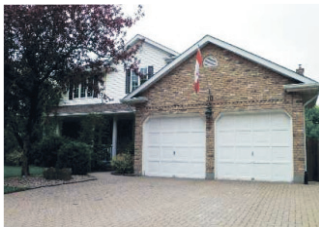
FONHILL $469,000 stevejenkins.ca 11-211-99 X2110785