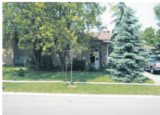
COOL IN THE POOL - 3 BDRM BUNGALOW $365,000 briansnow.org 11-281-30 W2133051