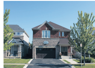
GREAT FAMILY HOME $499,900 PresswoodTeam.com 11-254-30 W2124351