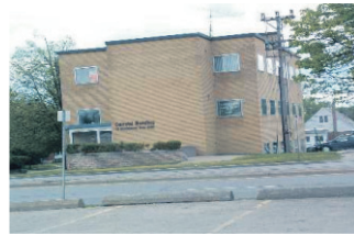
PROFESSIONAL SPACE - GREAT LOCATION $950/Month PresswoodTeam.com 11-135-30 W2078406