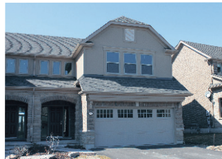
FINISHED TOP TO BOTTOM! $499,900 PresswoodTeam.com 11-136-91 X2078157