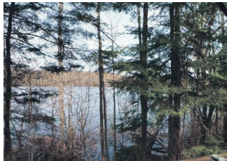
LAKEFRONT 40+ ACS NEAR ALGONQUIN $149,000 stevejenkins.ca 11-220-VL X2114086