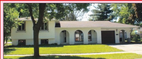
3260 WOODWARD AVE. $419,900

SOLD Get the Most Experience Working For You.