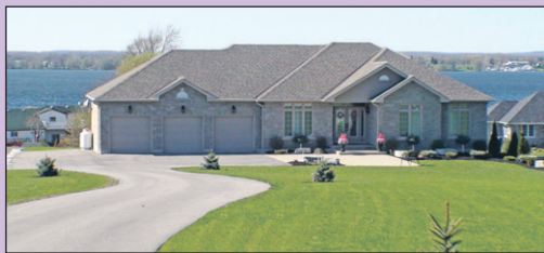
IS IT TIME TO RETIRE...ON THE WATER?? $1,150,000

Mother and Daughter...The most Natural relationship on earth... for the most Important choice you'll ever make!