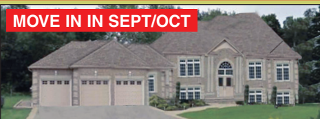
MOVE IN IN SEPT/OCT