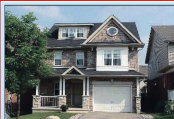
16 TRUESDALE $369,900

Totally upgraded with stylish decor in mint condition. This 3 bdrm, 2 bath home is located in a great area close to all amenities. Nicely landscaped and fully fenced yard. Includes 5 appliances, central air & all upgraded light fixtures. Totally move in ready.