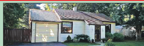
AFFORDABLE HOME ON MATURE TREE LOT $249,900

SOLD Get the Most Experience Working For You.