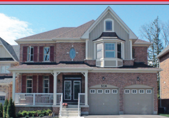
314 EATON STREET $774,900

Luxurious custom built bungalows and 2 storeys on half acre lots with town water, gas and cable. UNBELIEVABLE standard features package...granite countertops, hardwood, solid maple kitchens, plaster mouldings, all brick, vinyl casement windows, full double car garage & much more.