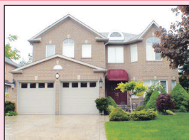
RAVINE BACKDROP RIGHT OUT OF A MAGAZINE ON AN "IT" STREET IN G'TOWN SOUTH $834,900

Move into your dream home as early as this summer if you move fast! 2800 sq ft of luxury finishes awaits you in this elegant bungalow masterpiece with oversized triple car garage. And a package you can't help but be ecstatic about: 9' ceilings on main flr, gorgeous Maple kit. & bathroom vanities, granite countertops, 3 generous sized bdrms & 3 bathrooms, gas fireplace, amazing cathedral ceiling in family rm and open concept living you can't find anywhere but custom estates likes this one. Plus a WALKOUT bsmt! Select all your own colours. NO HST. Call for the exclusive details.