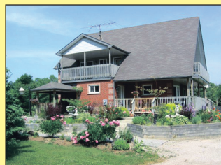
WELCOME HOME TO THIS PARK-LIKE 2.74 ACRES $664,900

Beautifully maintained showpiece home with a whopping 3600 sq. ft plus a walkout bsmt awaiting your ideas. Gorgeous patterned concrete balcony & patio plus concrete ballisters & handrails that have a grandiose Tuscan feel - and a wrought iron circular staircase to boot! Prof. landscaped with a concrete driveway that sets this house apart with its amazing curb appeal. Pride of ownership inside & out...plaster crown mouldings, custom trim and baseboards, 9' ceilings on main flr, french doors, hrdwd flrs & stylish ceramics throughout, California shutters, solid staircase. Excellent layout on every floor with amazing square rooms! Professionally painted top to bottom, master bdrm retreat with Spc bthrm out of Trump Tower that you have to see!