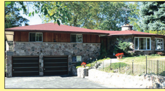
APPROX. 1 ACRE OF GORGUESNESS, VERY NEAT LAYOUT WITH GREAT ACCESS TO TOWN! $584,900

Sprawling, 4 bdrm California style bungalow features a unique layout with massive principal rooms having soaring cathedral ceilings, 2 floor to ceiling fireplaces, lovely newer kitchen, gleaming hardwood floors, all replaced windows, roof (2005), 200 amp service, high speed internet & freshly painted thruout. Convenient main floor laundry and brand new powder room. Gorgeous mature landscaping, tandem 4 car garage and a long driveway that holds a dozen cars. Excellent location - only 15 minutes to 401 and walk to GO train later this year.