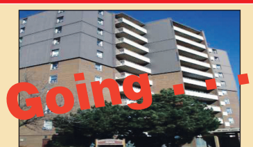
AFFORDABLE CONDO IN GREAT LOCATION $139,900

This charming bungalow with attached garage plus a workshop with power, would make a perfect starter or retirement home. Features a cozy kitchen with renovated cabinets, ceramic floor and a breakfast nook. Spacious living room overlooks a lovely private yard and features a gas fireplace, large window and sliding doors to a large deck of eco friendly material. The formal separate dining room will hold all your guests. Convenient main floor laundry room. Includes 4 appliances. Great value for a detached home on a quiet street.