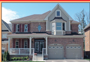
314 EATON STREET $774,900