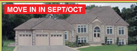
MOVE IN IN SEPT/OCT