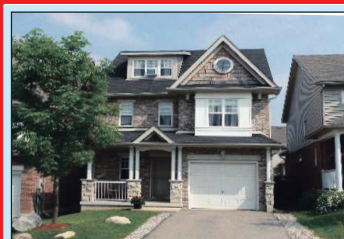
16 TRUESDALE $369,900

Get the Most Experience Working For You.