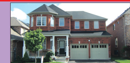
113 ARBORGLEN DRIVE $619,900