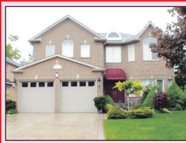
RAVINE BACKDROP RIGHT OUT OF A MAGAZINE ON AN "IT" STREET IN G'TOWN SOUTH $834,900

Move into your dream home as early as this summer if you move fast! 2800 sq ft of luxury finishes awaits you in this elegant bungalow masterpiece with oversized triple car garage. And a package you can't help but be ecstatic about: 9' ceilings on main flr, gorgeous Maple kit. & bathroom vanities, granite countertops, 3 generous sized bdrms & 3 bathrooms, gas fireplace, amazing cathedral ceiling in family rm and open concept living you can't find anywhere but custom estates likes this one. Plus a WALKOUT bsmt! Select all your own colours. NO HST. Call for the exclusive details.