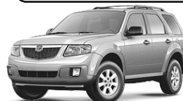
GT-V6 model shown

2011 CX-7 Lease from $339* per month at 1.9% for 48 months with $1,995 down or 0% PURCHASE FINANCING* FOR 60 MONTHS