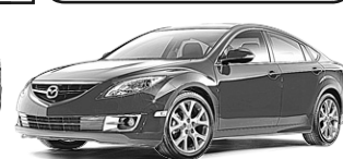
GT-V6 model shown