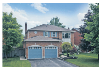
GORGEOUS 4 BDRM WWW.WILLSSELL.CA $439,900