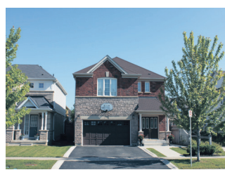
GREAT FAMILY HOME $499,900