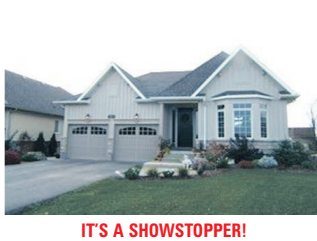
IT'S A SHOWSTOPPER! $539,900