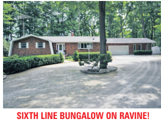
SIXTH LINE BUNGALOW ON RAVINE! $695,000