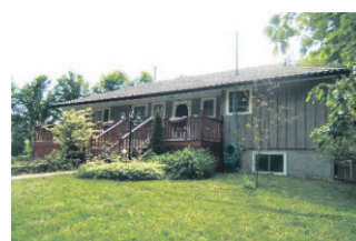
HEAVENLY 1 ACRE BESIDE BRUCE TRAIL $429,900