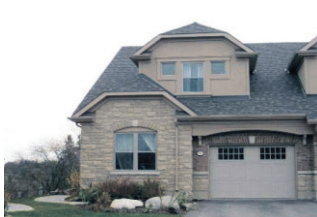
LUXURIOUS CHARLESTON HOME $514,900