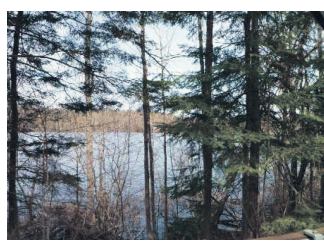
LAKEFRONT 40+ ACS NEAR ALGONQUIN $149,000