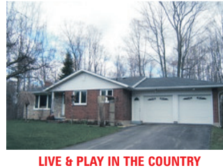
LIVE & PLAY IN THE COUNTRY $749,000