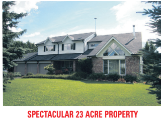
SPECTACULAR 23 ACRE PROPERTY $979,000