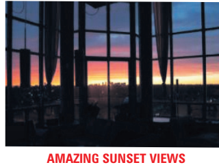
AMAZING SUNSET VIEWS $419,000