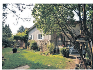
VERY UNIQUE PROPERTY! $569,000