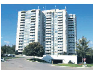
GREAT 1 BDRM - LOOKS OUT ONTO WOODS $219,900