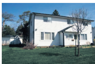
SPACIOUS HOME - WALK TO PARKS, STORES $359,900