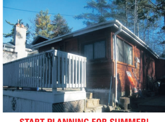
START PLANNING FOR SUMMER! $199,900