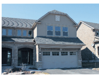
FINISHED TOP TO BOTTOM! $499,900