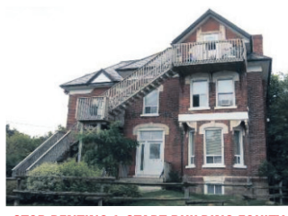
STOP RENTING & START BUILDING EQUITY $144,900