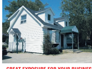
GREAT EXPOSURE FOR YOUR BUSINESS $299,000

Barry Cordingley*/Valerie Keslick* 11-265-30 W2128262