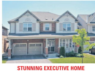
STUNNING EXECUTIVE HOME $599,900