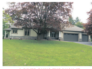
A RIVER RUNS THROUGH IT $1,295,000