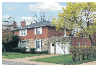
CUSTOM HOME - RESTORED & UPGRADED $349,900