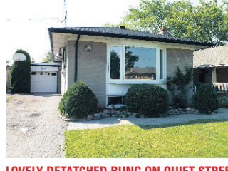
LOVELY DETACHED BUNG ON QUIET STREET $349,000