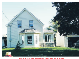
ELEGANT EXECUTIVE HOME $545,000