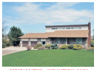
GREAT LOCATION - AND NATURAL GAS! $595,000