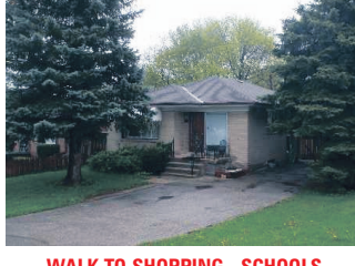
WALK TO SHOPPING - SCHOOLS $327,000