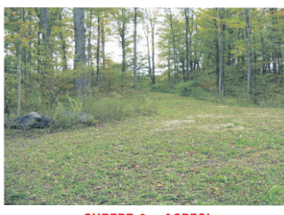
SUPERB 2+ ACRES! $89,000