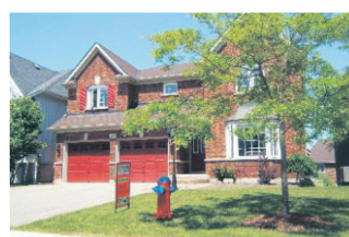
STEWART'S MILL W/FIN W/OUT BSMNT $599,000