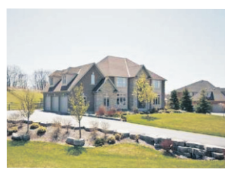
EXQUISITE CUSTOM HOME ON ALMOST 2 ACRES $1,489,900