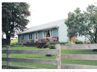
GREAT INVESTMENT OPPORTUNITY $1,830,000