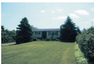
EXCELLENT BUNGALOW ON 1 ACRE IN ERIN $339,000