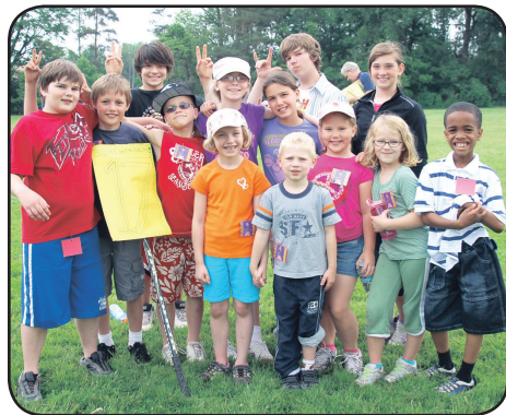
Team Bubblegum Nacho strikes a pose.