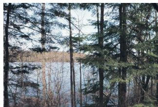
LAKEFRONT 40+ ACS NEAR ALGONQUIN $149,000 stevejenkins.ca 11-220-VL X2114086