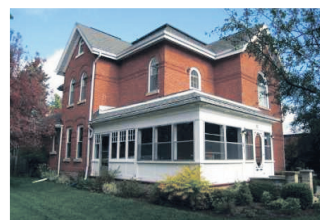
CENTURY OLD CHARM RESTORED & IMPROVED $774,900 haltonhomes.com 11-079-90 W2046120