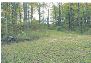
SUPERB 2+ ACRES! $89,000 Kathy Ellis* 11-039-VL X2032628