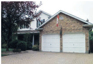
FONHILL $469,000 stevejenkins.ca 11-211-99 X2110785