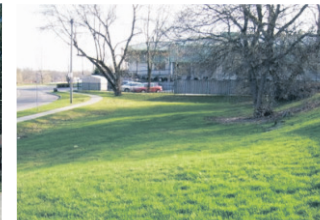
WHAT A DEAL THIS PROPERTY IS! $95,000 David Burland* 09-081-VL W2024635