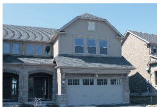
FINISHED TOP TO BOTTOM! $499,900 PresswoodTeam.com 11-136-91 X2078157