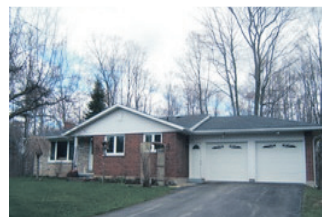
LIVE & PLAY IN THE COUNTRY $749,000