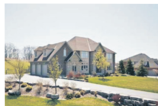
EXQUISITE CUSTOM HOME ON ALMOST 2 ACRES $1,489,900