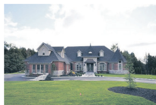
SPECTACULAR 4100 SQ.FT. BUNGALOW-3 ACRES $1,399,000