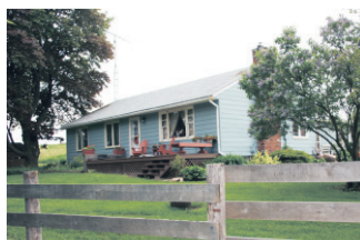
GREAT INVESTMENT OPPORTUNITY $1,830,000