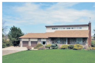
GREAT LOCATION - TEXT 63636 Tour 30 $595,000