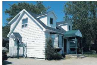
GREAT EXPOSURE FOR YOUR BUSINESS $299,000