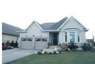
IT'S A SHOWSTOPPER! $539,900