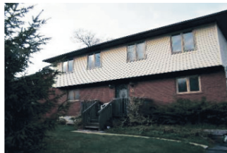
THIS HOME HAS SO MUCH TO OFFER! $374,800