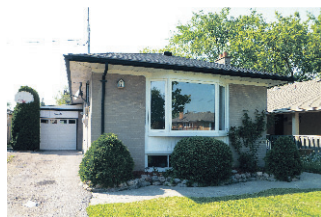
LOVELY DETACHED BUNGALOW-QUET STREET $349,000