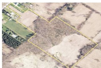
PRIME PROPERTY TO BUILD DREAM HOME $550,000