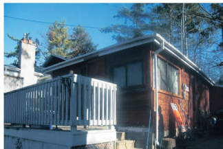
START PLANNING FOR SUMMER! $199,900