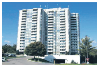
GREAT 1 BDRM - LOOKS OUT ONTO WOODS $219,900