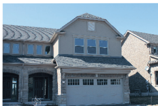
FINISHED TOP TO BOTTOM! $499,900