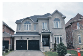
IMMACULATE - TEXT 63636 Tour 31 $739,900