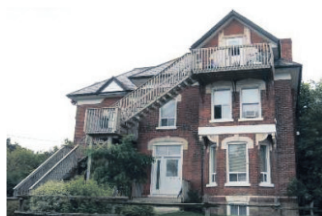
STOP RENTING & START BUILDING EQUITY $144,900