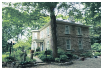
4.9 ACRES OF MATURE HARDWOOD & STREAM $679,000