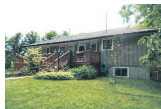
HEAVENLY 1 ACRE BESIDE BRUCE TRAIL $429,900