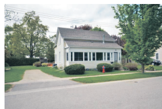
WELL MAINTAINED CENTURY HOME $369,900