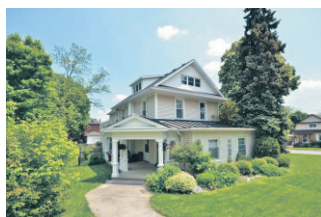
TEXT - Janicer1 to 63636 For More Info & Photos $759,900