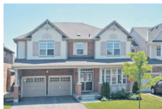
STUNNING EXECUTIVE HOME $599,900