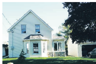
ELEGANT EXECUTIVE HOME $545,000