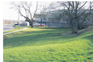
WHAT A DEAL THIS PROPERTY IS! $95,000