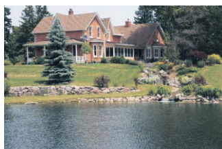
COUNTRY AT ITS BEST! $2,595,000

Listing details available at: www.johnsonassociates.ca