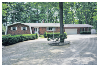
SIXTH LINE BUNGALOW ON RAVINE! $695,000