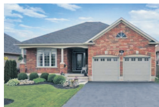
EXQUISITE CHARLESTON BUNGALOW $509,000