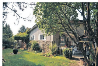
VERY UNIQUE PROPERTY! $569,000