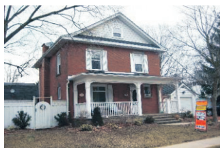
AMAZING CENTURY HOME! $494,900