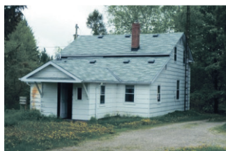
93 ACRE PROPERTY - PRIME FARMLAND $549,000