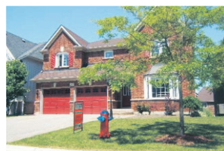
STEWART'S MILL W/FIN W/OUT BSMNT $599,000