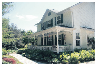
SERENE COUNTRY LIVING! MOVE IN CONDITION $489,900