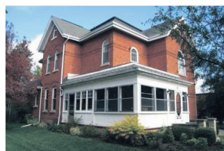
CENTURY OLD CHARM RESTORED & IMPROVED $774,900