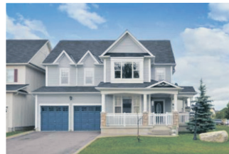
VIRTUAL TOUR @ www.willsell.ca $549,900