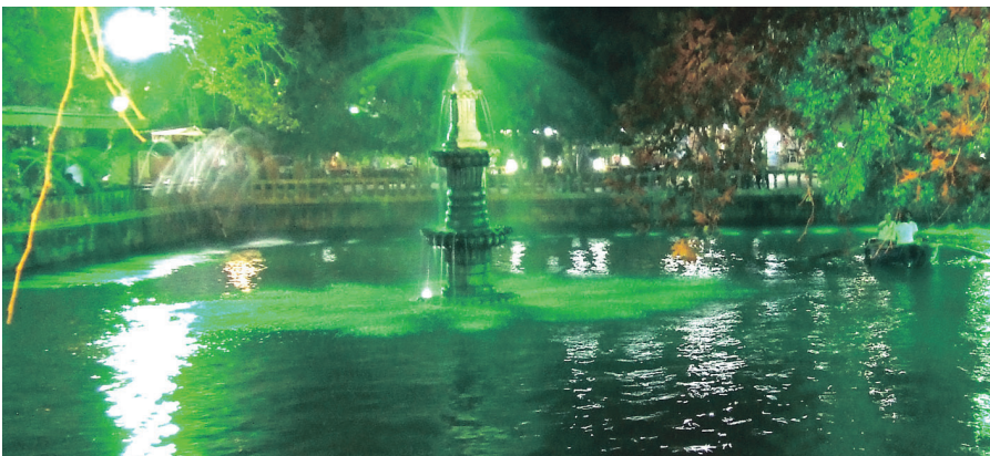
The pond connected to the location of the sacred carp.