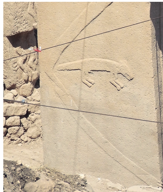
Top right : The fox, one of the magnificent stone carvings on the pillars at Gobekli tepe.