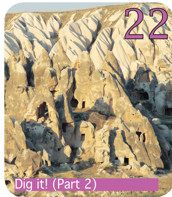
Dig it! (Part 2)