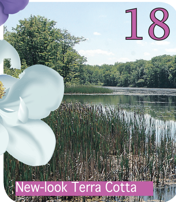
New-look Terra Cotta