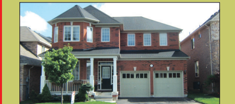
113 ARBORGLEN DRIVE $619,900