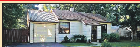
AFFORDABLE HOME ON MATURE TREE LOT $259,900

Get the Most Experience Working For You.