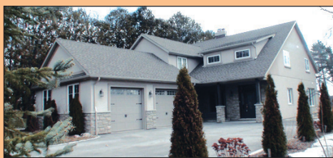
303 MAPLE AVENUE $999,000

This waterfront masterpiece is almost new and absolutely breathtaking on "millionaire's row" in Prince Edward! Three good sized bdrms & three full bathrooms with a living space right out of a decorating magazine. Amazing windows saturate the back of the house to really appreciate the unbelievable views of deck, inground pool, your very own boardwalk & dock and all with the waterfront backdrop that will put you at peace straight away. Enjoy the swans, the breathtaking sunset view, inhale the fresh air, all the while compromising nothing on quality and top notch interior finishes. Call us for details.