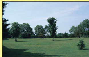
WELCOME HOME TO THIS PARK-LIKE 2.74 ACRES $664,900

Stunning, all brick, custom home featuring a modern open concept design & a unique blend of elegance & country charm. Beautifully decorated & recently improved with richly stained walnut floors, ceramics & lovely new trim & baseboards. Impressive great room with floor-to-cathedral ceiling brick fireplace. Full 1 bdrm inlaw suite beautifully done with games room, living rm w/stone fireplace & lots of pot lights. Detached dbl car garage plus a fantastic workshop (30'x55') with heat, hydro, water, 14' ceiling, 2 truck doors & mezzanine. Great location - just 20 min. to Georgetown GO. Call for full details.