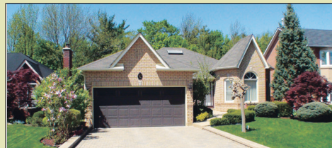
57 GOLLOP CRES. $559,900

Get the Most Experience Working For You.