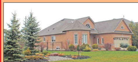
17 DONAGHEDY DRIVE $549,900

Get the Most Experience Working For You.