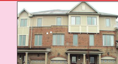
158 CEDAR LAKE CRES. $349,900

Get the Most Experience Working For You.