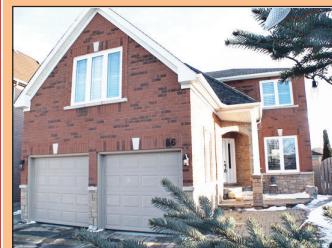
86 STANDISH STREET $579,900

Sprawling, 4 bdrm California style bungalow features a unique layout with massive principal rooms having soaring cathedral ceilings, 2 floor to ceiling fireplaces, lovely newer kitchen, gleaming hardwood floors, all replaced windows, roof (2005), 200 amp service, high speed internet & freshly painted thruout. Convenient main floor laundry and brand new powder room. Gorgeous mature landscaping, tandem 4 car garage and a long driveway that holds a dozen cars. Excellent location - only 15 minutes to 401 and walk to GO train later this year.