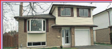
31 GOLF VIEW DRIVE $399,900

Spanish-Inspired styling, this home is situated on large lot enveloped by massive mature trees. Large front porch & side covered verandah to sit back & relax and watch the kids play. Home has been upgraded with 35Year shingles, some new windows, new furnace & A/C, electrical panel, aluminum soffits/gutters, maple kitchen with granite, solid stairs, newly refinished hardwood, Etc. Spacious family friendly layout with great fully fenced yard awaiting ur. Ideas. Perfect 4 Family!