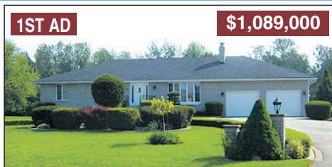
1ST AD $1,089,000

CUTE AS A BUTTON ON GREAT LOT! This cute & cozy 2+1 Bdrm Bungalow is located in Georgetown on an oversized lot! Large liv/din combo and updated kit w/ w/o out to yard. Finished bsmt offers 3rd bdrm & large rec room with roughed-in washroom. Call the Krause's for your personal viewing. MLS# W2108184