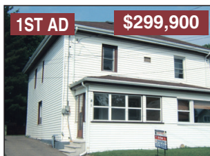
1ST AD $299,900

GREAT VALUE IN GEORGETOWN! This 4 bdrm, 3 bath, detached home offers lots of living space for the growing family. Main floor features large family sized eat-in kitchen with w/o to fenced yard complete with large deck. FR is open to the kitchen with gorgeous natural hardwood floors & gas fireplace. LR/DR is combined. Master features large walk-in closet & 4 pc ensuite. MLS# W2082807