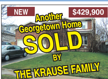
NEW Another Georgetown Home $429,900

COMMERCIAL UNIT FOR LEASE! Spacious front unit approx. 3100 sq. ft. on Guelph Street - great location for your business. Features lots of parking, Highway #7 exposure, 2 pc wsrn, high ceilings, storage area, commercial/retail zoning. Call the Krause Family for your personal viewing. MLS# W2021601