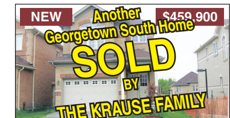
NEW Another Georgetown South Home $459,900

LARGE PROPERTY IN THE HEART OF STEWARTTOWN! This cozy 1-1/2 storey home offers open concept DR/LR and large family sized kitchen with w/o to mudroom. Main flr further features mstr bdrm & 2 pc bath. 2 great sized bdrms up with 2nd flr laundry & 4 pc bath. Property features both natural gas & municipal water and is only 10 mins to 401. New windows, roof ('09). Includes 4 appls. Call the Krause's for a personal viewing! MLS# W2049014