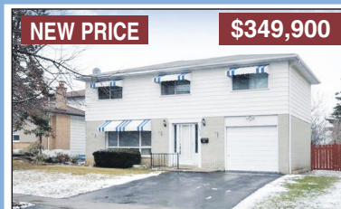
NEW PRICE $349,900

LARGE FAMILY HOME IN CENTRAL GEORGETOWN This 4 bdrm, 3 bath home is perfect for a big family! Features new H/E furnace & AC 2011, lots of living space with hardwood in D/R, L/R, and all bedrooms. Family sized kitchen. Layout offers 4 great sized bdrms, master has his/her closets and ensuite! Great family home at an unbelievable price! MLS# W2011338