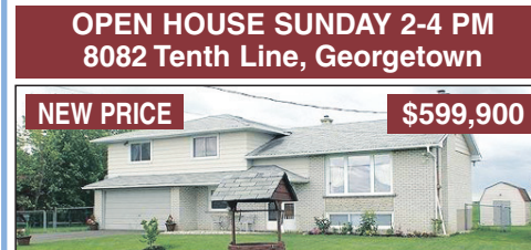
OPEN HOUSE SUNDAY 2-4 PM 8082 Tenth Line, Georgetown

BEAUTIFUL BUNGALOW ON LARGE LOT! Excellent almost 2000 sq ft, 3 bdrm bungalow on a quiet, family friendly street in Acton. Fabulous open-concept model with large kitchen and vaulted ceiling family room complete w/ gas fireplace. This one won't last long! MLS# W2124521