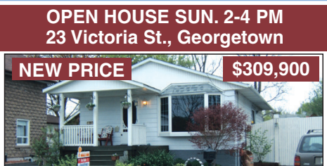
OPEN HOUSE SUN. 2-4 PM 23 Victoria St., Georgetown

LOCATION, LOCATION, LOCATION! Amazing rural home just minutes to the 401, 407 & Georgetown! Beautifully renovated home featuring all marble and hardwood flooring. Newer bathroom renovations featuring custom cabinetry and granite countertops. This large family home is situated on 0.67 of an acre and offers tranquil views of the Escarpment. A must see! MLS# W2089000