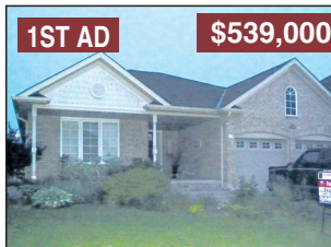
1ST AD $539,000

COMLETELY RENO'D SEMI IN GEORGETOWN Beautifully reno'd 2 bdrm, 2 bath semi located in central Gtwn - walking distance to the GO! New maple kit, maple hardwood, berber carpet and contemporary main bath w/ square double sinks, deep soaker tub and much much more! Call the Krause's! MLS# W2124455