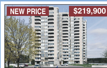
NEW PRICE $219,900

LARGE FAMILY HOME IN CENTRAL GEORGETOWN This 4 bdrm, 3 bath home is perfect for a big family! Features new H/E furnace & AC 2011, lots of living space with hardwood in D/R, L/R, and all bedrooms. Family sized kitchen. Layout offers 4 great sized bdrms, master has his/her closets and ensuite! Great family home at an unbelievable price! MLS# W2011338