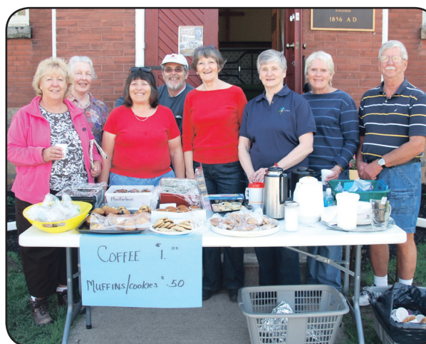
LEFT: Volunteers make sure the customers stay happy and hydrated.