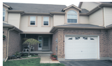
9 Ireland Place, Guelph Sat, May 28 & Sun, May 29, 2:00-4:00 LatamandLatam.com $239,888 11-219-99 NEW