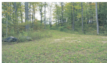
SUPERB 2+ ACRES! $89,000 Kathy Ellis* 11-039-VL X2032628