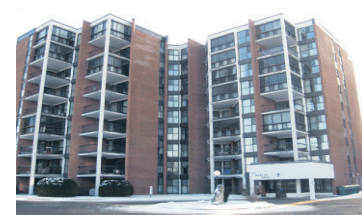
22 Marilyn Drive, #507, Guelph Saturday, May 28, 2:00-4:00 LatamandLatam.com $225,000 11-209-99 X2109208