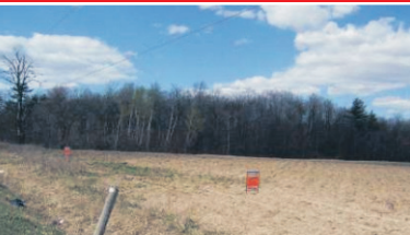
SUPER LOCATION - TEXT 63636 TOUR32 $269,000 Anna Lostritto* 10-072-VL W2005247