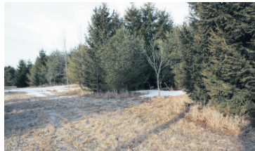
10 ACRES ON PAVED ROAD $275,000 LatamandLatam.com 11-105-VL X2062396