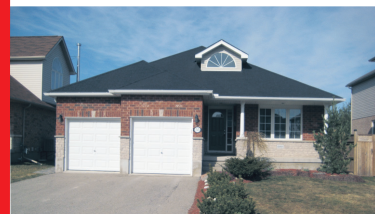
55 Harper Crescent, Fergus Sunday, May 29, 2:00-4:00 LatamandLatam.com $425,000 11-114-91 X2068950