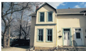
BEAUTIFUL SEMI - STEPS TO TOWN $269,900 haltonhomes.com 11-027-90 W2069155