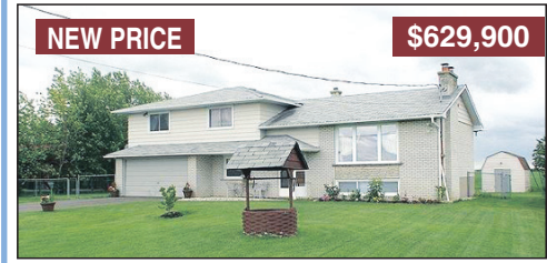
NEW PRICE $629,900

OPEN HOUSE SUNDAY 2-4 PM 23 Victoria Street, Georgetown