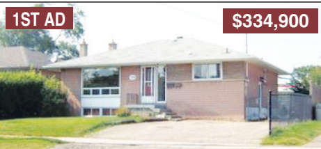
1ST AD $334,900

Custom Everything! Gourmet Custom kitchen w/ built-in appliances, 5" plank mahogany flooring thru-out, custom tile on main floor and custom limestone mantel in F/R. This 4 bdrm, 4 bath home shows awesome! Master has gas f/p, w/ in closet and 6 pc marble ensuite. Every bdrm has an ensuite! Call the Krause's for your personal viewing.