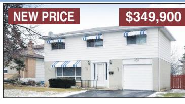
NEW PRICE $349,900

This cozy 1-1/2 storey home offers open concept DR/LR and large family sized kitchen with w/o to mudroom. Main flr further features mstr bdrm & 2 pc bath. 2 great sized bdrms up with 2nd flr laundry & 4 pc bath. Property features both natural gas & municipal water and is only 10 mins to 401. New windows, roof (09). Includes 4 appls. Call the Krause's for a personal viewing! MLS# W2049014