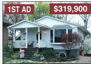
1ST AD $319,900