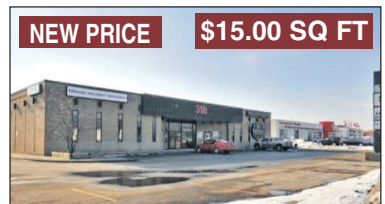
NEW PRICE $15.00 SQ FT

All the elegance of a million dollar home on 46 acres. Home features; granite, modern kitchen, large principal rooms, 6 walk-outs, beautiful views. Property offers: Horse Stalls, paddocks, sand ring, detached shop. More than we can mention here. Contact us for a list of features. MLS# X2055509