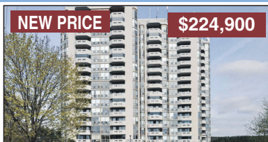
NEW PRICE $224,900