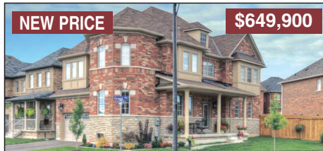
NEW PRICE $649,900

Amazing rural home just minutes to the 401, 407 & Georgetown! Beautifully renovated home featuring all marble and hardwood flooring. Newer bathroom renovations featuring custom cabinetry and granite countertops. This large family home is situated on 0.67 of an acre and offers tranquil views of the Escarpment. A must see! MLS# W2089000