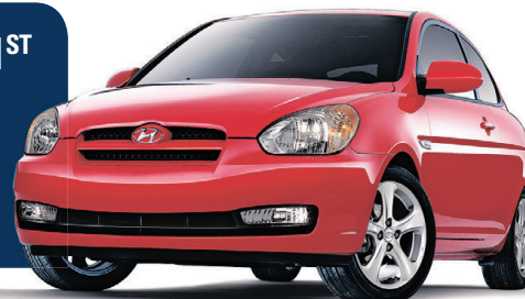
GL Sport model shown