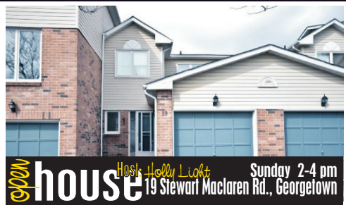
open house Host: Jolyn Light Sunday 2-4 pm 19 Stewart Maclaren Rd., Georgetown

It's Your Move and we have just the home! This well maintained 3 bedroom, 1.5 bathroom townhome is located on the friendliest street and offers open concept Living/Dining Room combo with hardwood floors, charming wainscoting, and large window overlooking backyard. The Kitchen offers a walkout to deck and 'window' into the Living area - perfect for entertaining or keeping an eye on the kids! Upper level with laminate flooring throughout. 3 bedrooms share the main (updated) 4 piece bathroom. Finished basement offers a Rec Room with laminate flooring, utility room, and plenty of storage. Close to Go transit, shopping and schools. $249,900.00 Georgetown MLS# W2062033