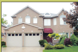
RAVINE BACKDROP RIGHT OUT OF A MAGAZINE ON AN "IT" STREET IN G'TOWN SOUTH $834,900

Move into your dream home as early as this summer if you move fast! 2800 sq ft of luxury finishes awaits you in this elegant bungalow masterpiece with oversized triple car garage. And a package you can't help but be ecstatic about: 9' ceilings on main flr, gorgeous Maple kit. & bathroom vanities, granite countertops, 3 generous sized bdrms & 3 bathrooms, gas fireplace, amazing cathedral ceiling in family rm and open concept living you can't find anywhere but custom estates likes this one. Plus a WALKOUT bsmt! Select all your own colours. NO HST. Call for the exclusive details.