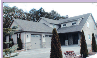
PIECE OF PARADISE BACKING ONTO THE 12TH GREEN WITH CUSTOM BUILT 3600 SQ FT. RESIDENCE $999,000

Absolutely stunning from top to bottom this home has it all and then some. In Georgetown's exclusive Arboglen community this spacious 4 bdrm jewel shows like a showhome! Large principal rooms & amazingly clean-lined, modern kit. comes complete with centre island, stylish Corian countertops, fresh subway tile backsplash, beautiful garden door with transom that walks out to great fully fenced yard that looks onto a laneway of other backyards only. Martha Stewart lives here but doesn't come with the house SORRY!