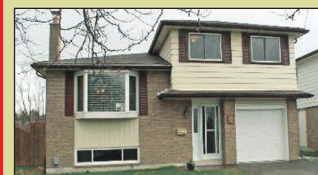
MASSIVE, PRIVATE BACKYARD WITH NO NEIGHBOURS BEHIND! $429,900

Backing onto true ravine with a view to North Halton Golf & Country Club, let this private sanctuary both inside & out take you away from the hustle and bustle of every day! In the heart of Georgetown's exclusive Park area yet on 0.73 of an acre, this home is nothing short of magnificent. Solid cherry, custom kitchen cabinets with amazing granite countertops, whimsical onyx backsplash, large centre island with seating for everyone & high end built-in appliances is just the start. Principal rms that people dream about with an open concept plan that you just won't find elsewhere and a mud rm/laundry that some would kill for. Truly a family home & an entertainer's DREAM!