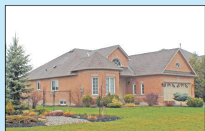
SPACIOUS BRICK BUNGALOW WITH PRIVATE LOT!! $549,900

Seeing is believing this amazing house situated on great street and backing onto GREENBELT!!! No corner left untouched, this home is finished to perfection from top to bottom and with the utmost of quality finishes. Bring all the clothes you couldn't fit into the last house in your transformed dressing room! Luxury abounds at every turn...beautiful hardwood, spectacular kitchen, lots of pot lighting, gas fireplace, California shutters, 5Pc spa-like ensuite, 4 bedrooms and 5th in the lovely bsmt along with a 3 pc bath/rec room. Plus an irrigation system & a backyard that turns every day in to cottage life. See you Sunday.