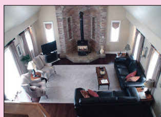
WELCOME HOME TO THIS PARK-LIKE 2.74 ACRES $615,000

Stunning, all brick, custom home featuring a modern open concept design & a unique blend of elegance & country charm. Beautifully decorated & recently improved with richly stained walnut floors, ceramics & lovely new trim & baseboards. Impressive great room with floor-to-cathedral ceiling brick fireplace. Full 1 bdrm inlaw suite beautifully done with games room, living rm w/stone fireplace & lots of pot lights. Detached dbl car garage plus a fantastic workshop (30'x55') with heat, hydro, water, 14' ceiling, 2 truck doors & mezzanine. Great location - just 20 min. to Georgetown GO. Call for full details.