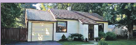
AFFORDABLE HOME ON MATURE TREED LOT $259,900

Beautifully maintained showpiece home with a whopping 3600 sq. ft plus a walkout bsmt awaiting your ideas. Gorgeous patterned concrete balcony & patio plus concrete ballisters & handrails that have a grandiose Tuscan feel - and a wrought iron circular staircase to boot! Prof. landscaped with a concrete driveway that sets this house apart with its amazing curb appeal. Pride of ownership inside & out... plaster crown mouldings, custom trim and baseboards, 9' ceilings on main flr, french doors, hrwd flrs & stylish ceramics throughout, California shutters, solid staircase. Excellent layout on every floor with amazing square rooms! Professionally painted top to bottom, master bdrm retreat with 5pc bthrm out of Trump Tower that you have to see!