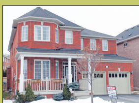
EXCLUSIVE AREA, LUXURIOUS FINISHES, PRISTINE HOME - THE TOTAL PACKAGE!! $619,900

Only 8 years young, this lovely home could be on the cover of Better Homes and Gardens...gorgeous landscaping, show stopper curb appeal & large concrete walkway! Airy, open concept design is just under 1900 sq. ft and features 3 + 2 bedrooms, main floor laundry, 3-way gas fireplace to be enjoyed from family room or kitchen! Plus, living/dining combination is the perfect entertaining space. Customized eat-in kitchen with cabinets galore, 4 pot drawers, angled glass cabinet & pantry wall...all with views to fabulous deck and backyard! Prestigious Georgetown South street. Call us to view.