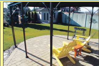
AMAZING RESORT-LIKE BACKYARD WITH A KNOCKOUT HOME TO MATCH $579,900

Seeing is believing this amazing house situated on great street and backing onto GREENBELT!!! No corner left untouched, this home is finished to perfection from top to bottom and with the utmost of quality finishes. Bring all the clothes you couldn't fit into the last house in your transformed dressing room! Luxury abounds at every turn...beautiful hardwood, spectacular kitchen, lots of pot lighting, gas fireplace, California shutters, 5Pc spa-like ensuite, 4 bedrooms and 5th in the lovely bsmt along with a 3 pc bath/rec room. Plus an irrigation system & a backyard that turns every day in to cottage life. See you Sunday.