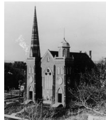
An early view of the Georgetown Methodist Church, later to become St. John's United Church at 11 Guelph Street. The tall spire was struck by lightning in the 1920s and never replaced.