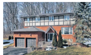
SPECIAL HOME ON QUIET CUL-DE-SAC $734,900