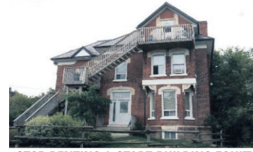
STOP RENTING & START BUILDING EQUITY $144,900