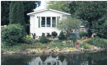
FEELS LIKE A COTTAGE-5MINS TO GUELPH $134,900