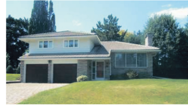
SUPERB PARK AREA LOCATION $529,000