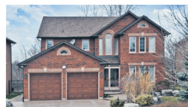
RAVINE LOT WITH INGROUND POOL $694,900