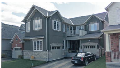
WOW FACTOR - OPEN CONCEPT $739,000