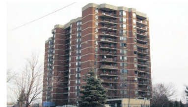
SPACIOUS UPGRADED UNIT O/L RAVINE $89,000