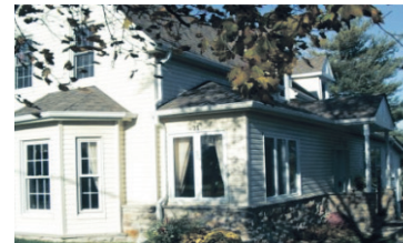
CENTURY OLD HOME COMPLETELY REDONE $569,000

Kevin Latam*/Mark Latam* 11-105-VL X2062396