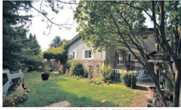
VERY UNIQUE PROPERTY! $599,000