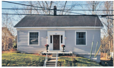
ROCKWOOD CENTURY HOME-www.willsell.ca $239,900