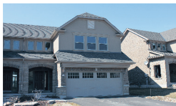
CHARLESTON HOME-FIN. TOP TO BOTTOM $499,900