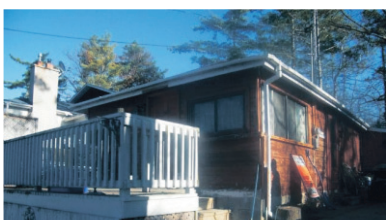
START PLANNING FOR SUMMER! $208,000