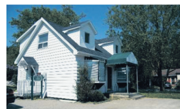
GREAT EXPOSURE FOR YOUR BUSINESS $299,000