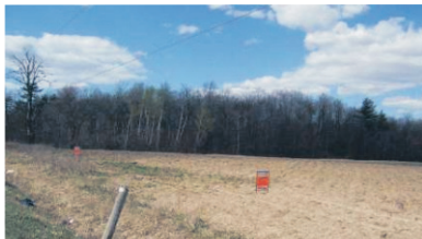
ENJOY THE VIEWS - SUPERB LOCATION $269,000