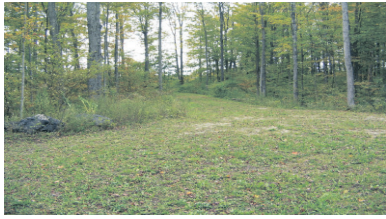
SUPERB 2+ ACRES! $89,000