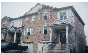
HUGE TOWNHOME - OVER 1700 SQ.FT. $329,900