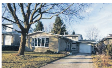
FAB HOME WITH HUGE DECK & POOL $314,900