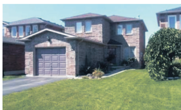
CHILD FRIENDLY STREET-GEORGETOWN SOUTH $374,900