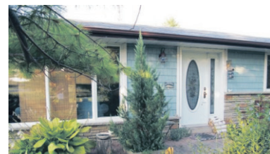
COMMUTER'S DREAM ON ONE ACRE $589,900