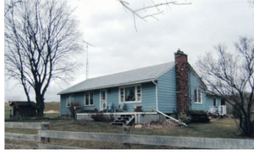
GREAT INVESTMENT OPPORTUNITY $1,830,000