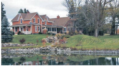
COUNTRY AT ITS BEST CONVENIENT TO CITY $2,595,000

Listing details available at: www.johnsonassociates.ca