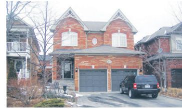
STOP SEARCHING-THIS 4 BDRM HAS IT ALL $529,900