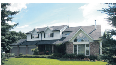
ESTATE HOME ON BEAUTIFUL PROPERTY $979,000