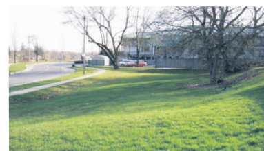
WHAT A DEAL THIS PROPERTY IS! $95,000