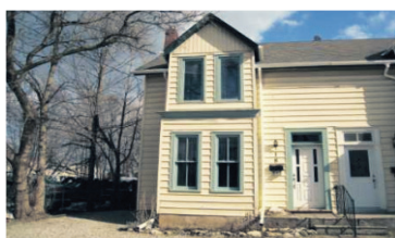
BEAUTIFUL SEMI - STEPS TO TOWN $269,900