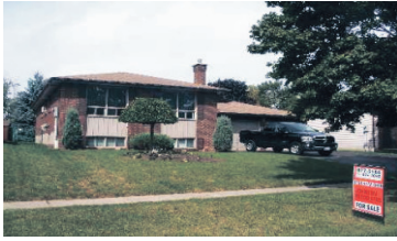
GREAT BUNGALOW - GREAT LAYOUT! $374,900