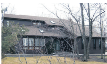
COUNTRY OASIS LOVINGLY RENO'D $599,000