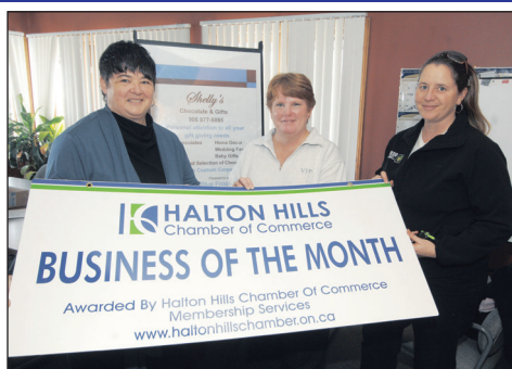
Shelly's Chocolate & Gifts