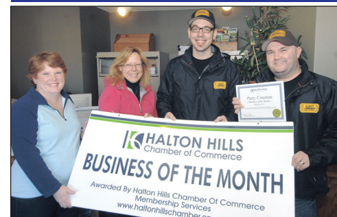
Party Cinemas