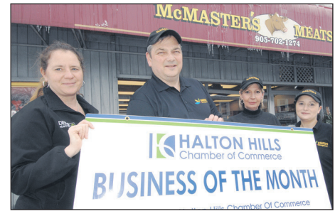
McMaster's Meats & Deli

items as well as those things we consume day-to-day like cooked meats that are hormone and steroid free. Their homemade soups, pies and lasagnas are well-presented and delicious. Antibiotic-free meats are a gift that can't be beat; coupled with gluten-free products, it makes McMaster's the place to be. Congratulations for a job well done!