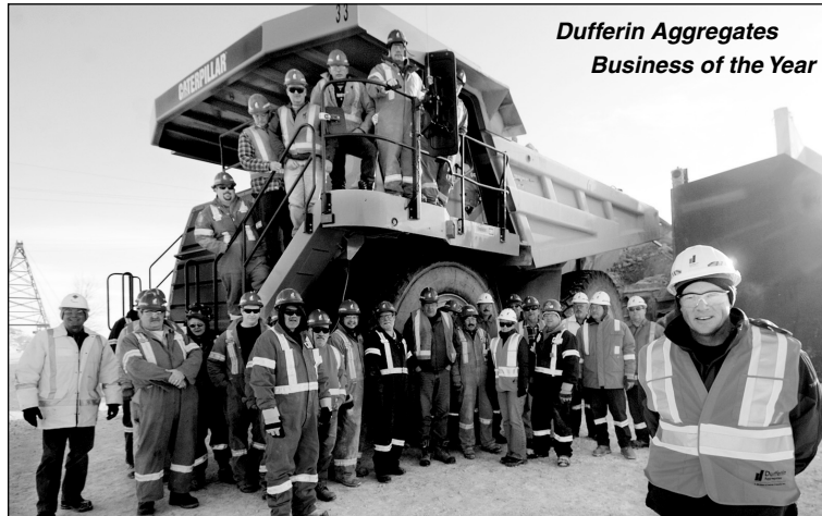
Dufferin Aggregates Business of the Year