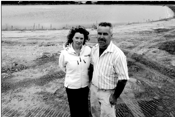
Sheridan Nurseries - Green Award