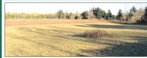
PRETTY 3.9 ACRE BUILDING LOT

Last one available on Abbutt Cres. 40 acre private wooded park with hiking trails, creek and pond owned by the residents. Close to Bruce Trail and riding facilities. 10 minutes to Georgetown, Terra Cotta, Erin and 'GO". $479,000. Irislrwin.com