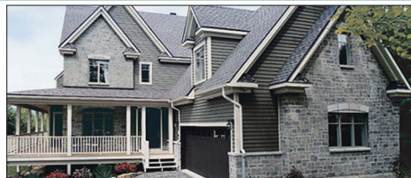
DESIGNED WITH DISTINCTION

New home to be built by Ricciuto Custom Homes on approx. 2/3 of an acre with lovely views. Choose your own colours and finishes. $899,000. Irislrwin.com