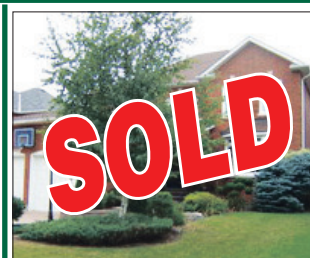
25 OAK RIDGE DRIVE