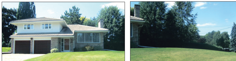
PRIME PARK AREA $529,000

OPEN HOUSE SAT. APRIL 16 & SUN. APRIL 17, 2-4 PM 19 VALLEYVIEW ROAD, GEORGETOWN