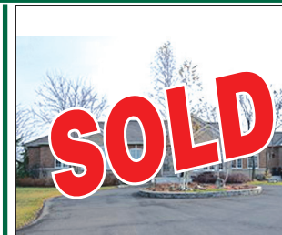
31 RUSSELL ST.