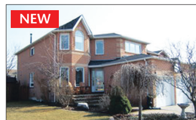
MATURE LOT AND THOUSANDS IN UPGRADES

OPEN HOUSE SAT. APRIL 16 & SUN. APRIL 17, 2-4 PM 38 WATSON ROAD, GEORGETOWN