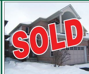
41 SAMUEL CRES.