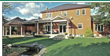
PERFECTION PLUS - EXCLUSIVE WILDWOOD ESTATES!!

Beautifully maintained and updated to perfection. Cherry kitchen, granite counters, porcelain tile floors, walkout from kitchen to a fabulous outdoor living space with large covered verandah and private mature yard. Finished basement with inlaw potential. $949,000. Irislrwin.com