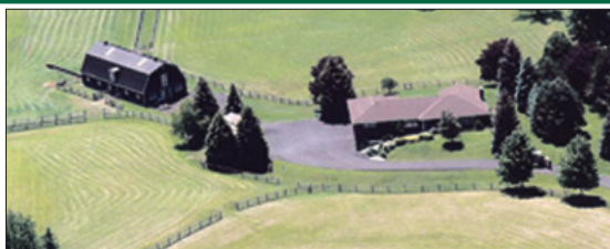
GLEN WILLIAMS - SUPERB HORSE FACILITY

Almost 50 acres with 10 stall barn, drive shed, paddocks, bush, creek and views plus 2500 sq. ft. custom bungalow with large principal rooms and walkout lower level. $1,395,000. Irislrwin.com