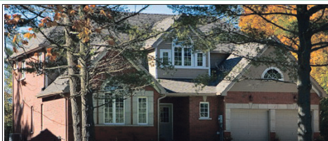
COUNTRY LIVING - GLEN WILLIAMS

New home to be built by Ricciuto Custom Homes on approx. 2/3 of an acre with lovely views. Choose your own colours and finishes. $899,000. Irislrwin.com