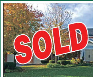
10612 SIXTH LINE