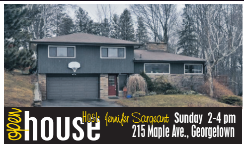
open house Host: Jennifer Sargeant Sunday 2-4 pm 215 Maple Ave., Georgetown

Splash! Spend this summer in a beautiful, very private backyard with a gorgeous inground pool siding on Cedarvale park. This exquisite Custom Built 3+1 bedroom, 2.5 bathroom home is located close to downtown Georgetown. The Open concept Kitchen/Dining area has Vinyl flooring, with a huge picture window and Built -In Microwave. Plenty of storage & ample counter space! The open concept Living Room has laminate flooring, beautiful Gas Fireplace, wall to wall window with a walk out to the deck that overlooks the ravine. Upstairs, the Master has a large closet & ensuite bathroom. The other 2 bedrooms share the main 4 piece bath. Main floor laundry with W/O and the lower basement is finished with W/O. $499,900.00 Georgetown MLS# W2062745