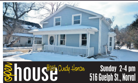
open house Host: Cindy Horan Sunday 2-4 pm 516 Guelph St., Norval

Extended Family? This home offers the perfect layout for your extended family! The bright main level Living Room is open to separate Dining Room with large bow window with window seat; both rooms have laminate floor. The galley Kitchen has an abundance of work and storage space, and window into cozy Family Room. French doors lead you into the huge 3 season Sunroom with insulated roof and access to the backyard. This level also has 1 bedroom. 2nd Level - updated Sitting Room, Kitchenette/Laundry, 2 bedrooms and full 4 piece bathroom. All this plus a full basement with tons of storage space, a double detached garage & parking for 10! $399,900.00 Norval MLS# W2066556