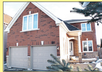
AMAZING RESORT-LIKE BACKYARD WITH A KNOCKOUT HOUSE TO MATCH $579,900

Get the Most Experience Working For You.