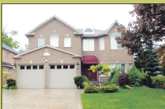
RAVINE BACKDROP RIGHT OUT OF A MAGAZINE ON AN "IT" STREET IN G'TOWN SOUTH $834,900

This charming bungalow with attached garage plus a workshop with power, would make a perfect starter or retirement home. Features a cozy kitchen with renovated cabinets, ceramic floor and a breakfast nook. Spacious living room overlooks a lovely private yard and features a gas fireplace, large window and sliding doors to a large deck of eco friendly material. The formal separate dining room will hold all your guests. Convenient main floor laundry room. Includes 4 appliances. Great value for a detached home on a quiet street.