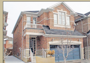
5169 LITTLE BEND DRIVE $569,900