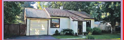
AFFORDABLE HOME ON MATURE TREADED LOT $259,900

This charming bungalow with attached garage plus a workshop with power, would make a perfect starter or retirement home. Features a cozy kitchen with renovated cabinets, ceramic floor and a breakfast nook. Spacious living room overlooks a lovely private yard and features a gas fireplace, large window and sliding doors to a large deck of eco friendly material. The formal separate dining room will hold all your guests. Convenient main floor laundry room. Includes 4 appliances. Great value for a detached home on a quiet street.