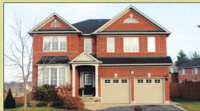
26 APPLE BLOSSOM CRES. $779,900

Absolutely stunning from top to bottom this home has it all and then some. In Georgetown's exclusive Arborgen community this spacious 4 bdrm jewel shows like a showhome! Large principal rooms & amazingly clean-lined, modern kit. comes complete with centre island, stylish Corian countertops, fresh subway tile backsplash, beautiful garden door with transom that walks out to great fully fenced yard that looks onto a laneway of other backyards only. Martha Stewart lives here but doesn't come with the house SORRY!