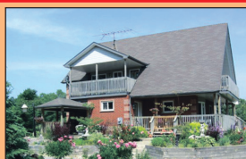
WELCOME HOME TO THIS PARK-LIKE 2.74 ACRES $668,900

Move into your dream home as early as this summer if you move fast! 2800 sq ft of luxury finishes awaits you in this elegant bungalow masterpiece with oversized triple car garage. And a package you can't help but be ecstatic about: 9' ceilings on main flr, gorgeous Maple kit. & bathroom vanities, granite countertops, 3 generous sized bdrms & 3 bathrooms, gas fireplace, amazing cathedral ceiling in family rm and open concept living you can't find anywhere but custom estates likes this one. Plus a WALKOUT bsmt! Select all your own colours. NO HST. Call for the exclusive details.