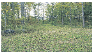
SUPERB 2+ ACRES! $89,000