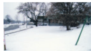
WHAT A DEAL THIS PROPERTY IS! $95,000