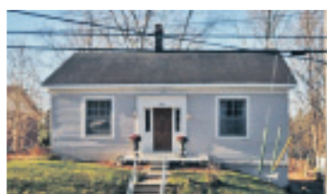
ROCKWOOD CENTURY HOME-www.willsell.ca $239,900