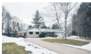
A GEORGETOWN LANDMARK! $749,000