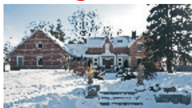
COUNTRY ESTATE WITH 2 PARCELS $2,745,000

Listing details available at: www.johnsonassociates.ca