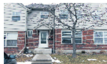
LOVELY UPDATED UNIT $179,900