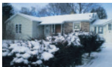
PRIME GLEN WILLIAMS LOCATION $254,900