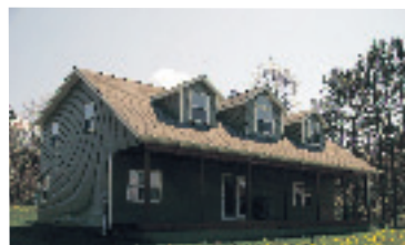
COMPLETELY REFINISHED 4 BDRM $329,000