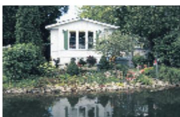
FEELS LIKE A COTTAGE-5MINS TO GUELPH $134,900