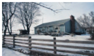
GREAT INVESTMENT OPPORTUNITY $1,830,000