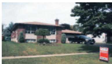
GREAT AREA - GREAT FLOOR PLAN $374,900