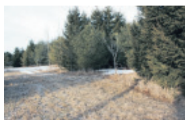
10 ACRES ON PAVED ROAD $275,000

Kevin Latam*/Mark Latam* 11-105-VL X2062396