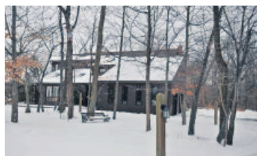
EXQUISITE COUNTRY OASIS $624,900