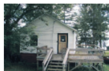
3 BEDROOM COTTAGE $69,000

Kevin Latam*/Mark Latam* 11-105-VL X2062396