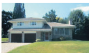
SUPERB PARK AREA LOCATION $529,000