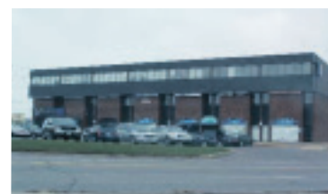
RENTAL UNIT AVAILABLE $13.00/SQ FT