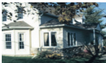
CENTURY HOME COMPLETELY REDONE! $579,000