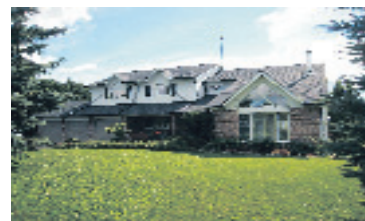
SPECTACULAR 23 ACRE ESTATE $979,000