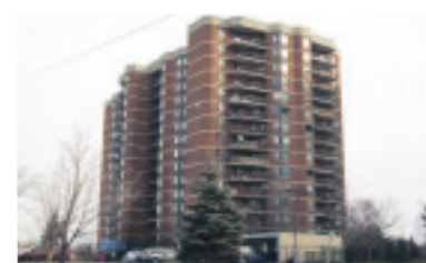
SPACIOUS UPGRADED UNIT O/L RAVINE $89,000