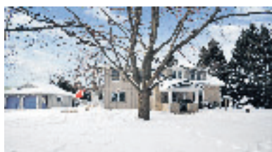
CHARM ON A COUNTRY ACRE-OUTSKIRTS OF ERIN $449,000