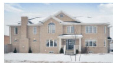
BRIGHT, BEAUTIFUL 2400 SQ FT HOME $499,900