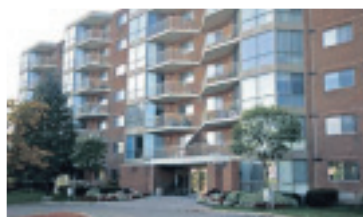
BEAUTIFULLY RENOVATED CONDO $259,900