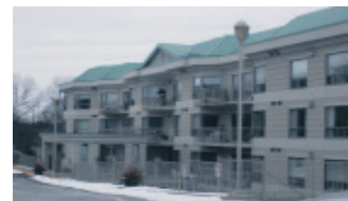
VICTORIA GARDENS PENTHOUSE UNIT $429,000