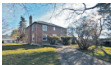
UNIQUE PROPERTY - ON 2 SEP LOTS $489,000