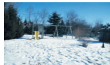
THIS HOUSE HAS SO MUCH TO OFFER! $388,000