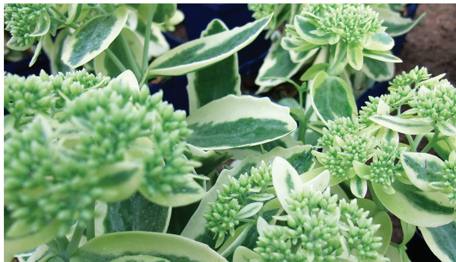
Sedum 'Mr. Goodbud'