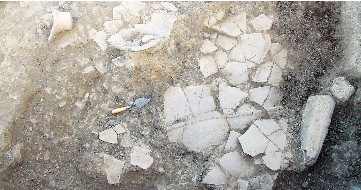
TOP: Don Ablett's square near the end of August 2010. The walls are 3,000 years old and waiting underground is the Bronze Age.