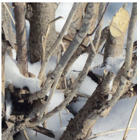
Beavers are "pruning" the trees and shrubs at WPEC.

It happens almost every year, and it's one of those unpredictable, natural events that owners/managers of wetland property have to address— beaver damage.