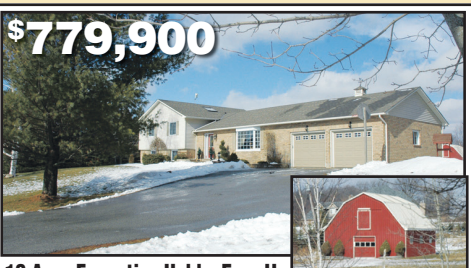
$779,900 10 Acre Executive Hobby Farm!!

Gorgeous, totally renovated country property will impress even the most discriminating of buyers. Just 12 mins to 401, this large 4 bed plus den home has it all; hardwood flooring, gourmet kitchen w/granite counters, huge family room, large L/R D/R, sep entrance to basement, multi-level deck w/built in pool overlooking red Gambrel roof 6 stall horse barn, paddocks and spring fed pond...too much to list! This home won't last long!! Call now for your private viewing! www.YourNeighbourhoodRealtors.com