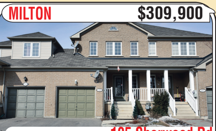
MILTON $309,900 195 Sherwood Rd

A show stopper! All brick executive semi 'Randall' model built by Arista. ~2200 sq ft apts with high end upgrds T/O, large foyer, open concept layout