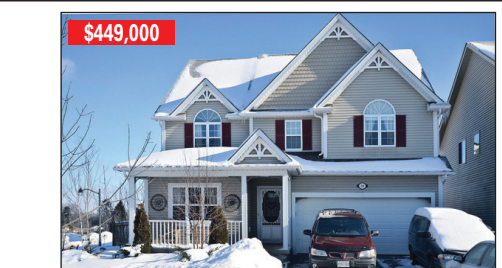
$449,000 HUGE WOW FACTOR!

LOCATION, LOCATION, LOCATION! Immaculately maintained FORMER MODEL HOME with partially finished walkout basement! This alluring all brick bungalow is ideal for making "the downsize". Visit tammysellsrockwood.com to view virtual tour