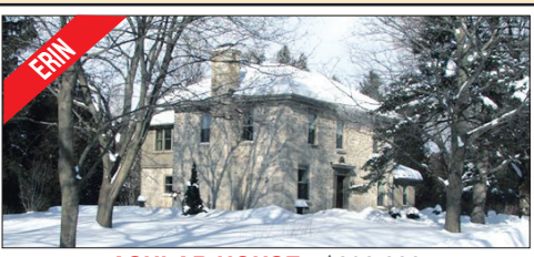
ERIN ASHLAR HOUSE - $920,000

Stone house perched on the banks of the Credit River, on a 10 acre property in the village of Erin (yes, 10 acres in the village). Totally private country retreat yet surrounded by friends and neighbours. Located within an hour's drive of TO, and a 5 min walk to the baker, butcher and Vintages. This 1850s stone farmhouse has been extensively renovated by a Victorian Restoration specialist and designed by a brilliant couple (with 4 children) with a keen eye for both beauty & practicality...handsome, precious gem.