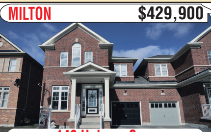
MILTON $429,900 149 Holmes Cres

This stunning custom built home is thoughtfully designed w/high end quality finishes & craftsmanship throughout! Spacious open concept main flr.