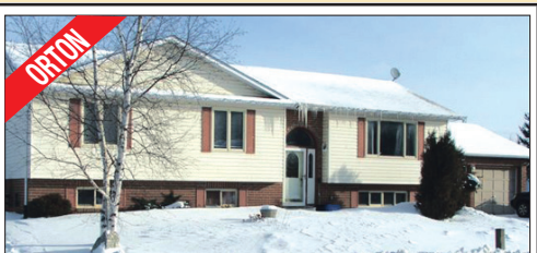
ORTON HALF ACRE IN ORTON $379,000

Stone house perched on the banks of the Credit River, on a 10 acre property in the village of Erin (yes, 10 acres in the village). Totally private country retreat yet surrounded by friends and neighbours. Located within an hour's drive of TO, and a 5 min walk to the baker, butcher and Vintages. This 1850s stone farmhouse has been extensively renovated by a Victorian Restoration specialist and designed by a brilliant couple (with 4 children) with a keen eye for both beauty & practicality...handsome, precious gem.