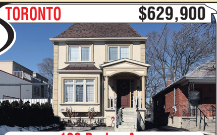
TORONTO $629,900 130 Barker Ave

This stunning custom built home is thoughtfully designed w/high end quality finishes & craftsmanship throughout! Spacious open concept main flr.