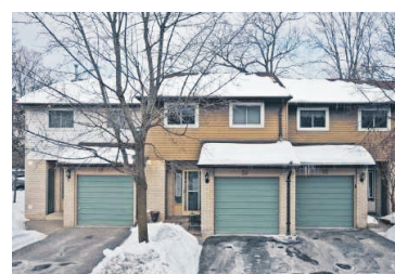
A VIEW TO DIE FOR! $299,900