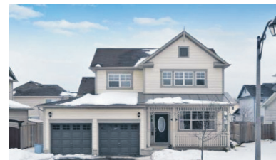
27 Hurst Street, Acton Sunday, February 20, 2:00-4:00 $369,000