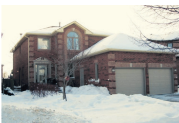
FERNBROOK - OPEN CONCEPT LIVING $499,900