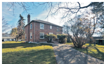
45 Rosefield Drive, Georgetown Sunday, February 20, 2:00-4:00 $489,900

briansnow.org/Anne Saint-Amour* 10-463-30 W2032539