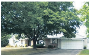
15837 River Drive, Georgetown Sat, Feb 19 & Sun, Feb 20, 2:00-4:00 $557,900

Iris Irwin*/Derek Dunphy* 10-325-30 W2021371