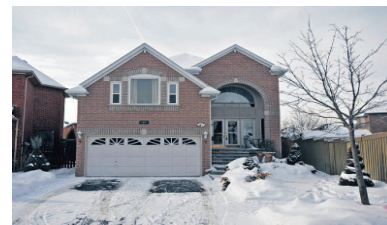
17 Huffman Drive, Georgetown Sunday, February 20, 2:00-4:00 $529,900