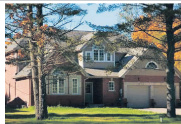
COUNTRY LIVING ON APPROX. 2/3 ACRE $899,900