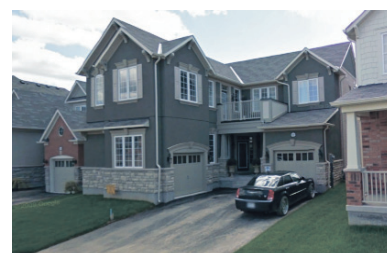
ABSOLUTELY BREATHTAKING $819,118