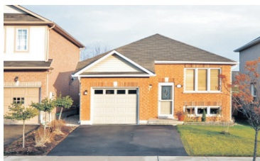
102 Atwood Avenue, Georgetown Sat, Feb 19 & Sun, Feb 20, 2:00-4:00 $355,000

briansnow.org/Anne Saint-Amour* 10-463-30 W2032539