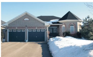
54 Johnson Crescent, Georgetown Sat, Feb 19 & Sun, Feb 20, 2:00-4:00 $509,950