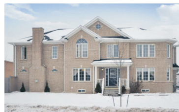
14 Morningside Drive, Georgetown Sat, Feb 19 & Sun, Feb 20, 2:00-4:00 $499,900