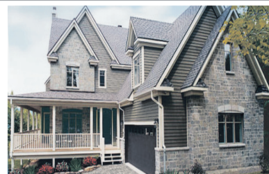
SPACIOUS 2900 SQ FT IN SUPERB LOCATION $949,000