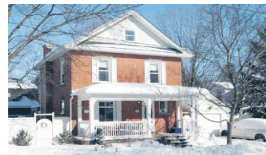
19 McNabb Street, Georgetown Sunday, February 20, 2:00-4:00 $549,900