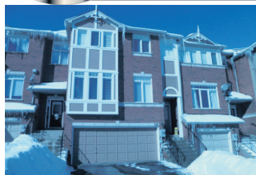
GREAT LOCATION $349,118