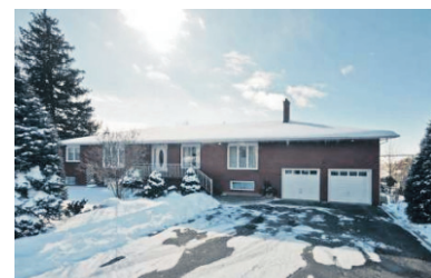
GARDINER'S PARADISE ON 3/4 ACRES $759,900

Johnson Associates Open House Tour Plan your weekend – when and where to attend the most desirable open houses: www.johnsonassociates.ca