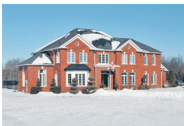
AMAZING HOME IN GREAT AREA $1,270,000