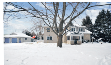
47 Guelph Road, Erin Saturday, February 19, 2:00-4:00 $469,900

Full listing details available at: www.johnsonassociates.ca