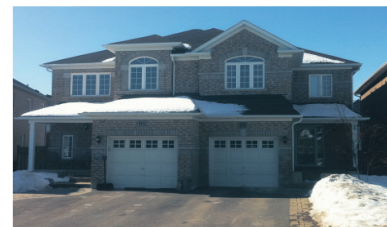
97 Snowberry Crescent, Georgetown Sat, Feb 19 & Sun, Feb 20, 2:00-4:00 $374,900