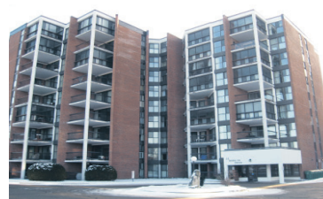
22 Marilyn Drive, #507, Guelph Sunday, February 20, 2:00-4:00 $174,500