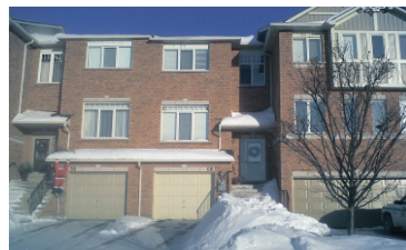
68 Atwood Avenue, Georgetown Sat, Feb 19 & Sun, Feb 20, 2:00-4:00 $289,900