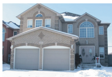
GREAT VIEWS, QUIET STREET $469,900