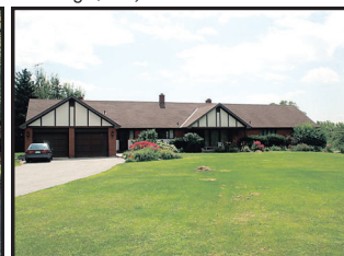
10 ACRE BUNGALOW ON LONG TERM FUTURE DEVELOPMENT 1130 BURNHAMTHORPE RD W, OAKVILLE

Backing onto protected forest, mins to 407 & city, wrap around deck, 8 car parking, kitchen with new stainless appliances, slate floor, hardwood, rec rm, landscaping with waterfall. $899,000.