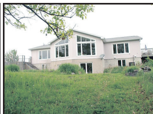
22.6 ACRE WATERFRONT ESTATE WITH MT NEMO VIEW 4480 APPLEBY LINE, BURLINGTON

Mins to city & 407 Hwy exit Neyagawa, 4 bedroom 2800 sq.ft. walkout custom bungalow, long private driveway, 2 car garage, cathedral ceiling great room & family rm, live in the country and sell later when multi residential development starts. Unique investment opportunity! $3,500,000.