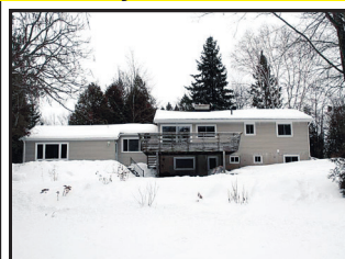
11.6 ACRE RENOVATED BUNGALOW HOBBY FARM 12570 NAS-ESQ TOWN LINE, MILTON

ESCAPE TO THE COUNTRY BUNGALOW NEARBY! THE MARKET IS HOT, HOT! CALL FOR FREE EVALUATION OF YOUR PROPERTY. I AM COMMITTED TO GETTING YOU SOLD FOR TOP DOLLAR! EXPERIENCE COUNTS & PROFESSIONAL MARKETING WORKS! Visit my website www.chrisdosne.com for more listings, photos and map locations.