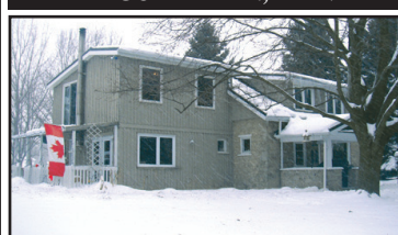
MINUTES FROM ERIN ON A COUNTRY LOT!

OPEN HOUSE SATURDAY 2-4 PM 47 GUELPH RD., ERIN