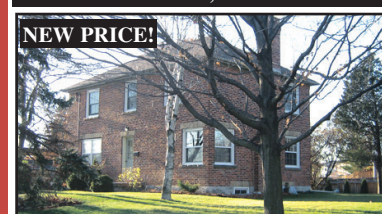
NEW PRICE! BEAUTIFUL OLDER FARMHOUSE IN TOWN ON A DOUBLE LOT!!

OPEN HOUSE SUNDAY 2-4 PM 45 ROSEFIELD DR., GEORGETOWN