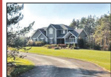
COUNTRY ELEGANCE YET CASUAL FAMILY HOME ON 5 ACRES

Full of character! 4 bedroom centre hall with lovely principal rooms, and a bright new main floor family room with cathedral ceiling! On a double lot too! You could have a pool, a large garage, or just a lovely private yard. OR you could build a second house, or sell the lot! Listed at $489,900.