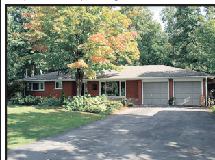
OPEN HOUSE SUN., Feb 27, 2-4PM 38 BURNHAMTHORPE RD W, OAKVILLE 407 to Neyagawa South to Burnhamthorpe turn left 1/2 ACRE BUNGALOW ON LONG TERM FUTURE DEVELOPMENT

Very private country estate ONLY 10 mins from 401/Milton City, long treed driveway, cathedral ceilings in living & dining rm, fireplaces, 2 car garage, detached workshop, creek, country trails. Call for Showing. $849,000.