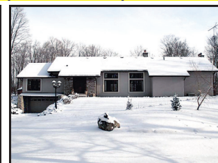
37 ACRE RENOVATED 3300 SQFT STUCCO BUNGALOW WITH I/G POOL 6190 FIFTEENTH SIDERD, MILTON

Nature lover's oasis with all the toys only 15 min to city, I/G heated pool with cabanas & hot tub on huge cedar deck, $80,000. Fenced tennis court, custom built bungalow, private treed long laneway, granite kitchen, huge family rm. fireplace inserts, NEW PRICE. Call for Showing. $749,000.