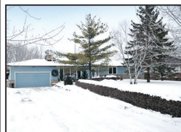
TENTH LINE NORTH OF STEELES

New listing! 4 bedroom charming home w/ main floor family room addition, 2 and 1/2 baths. CHARMING. Huge lot with newer oversized 2 car garage/workshop. Newer septic and still have room for a pool! Beautifully treed and private! Listed at $469,900.