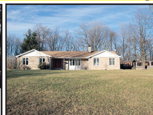
12.9 ACRE BUNGALOW WITH I/G POOL, TENNIS COURT, HOT TUB 12145 FOURTH LINE, MILTON

Very private, only 15 mins from 401/Milton city, complete in law suite with sep entrance, recently upgraded thru out, newer windows, newer hardwood, newer roof & exterior vinyl insulated siding, new paved circular drive, upgraded kitchen, stone wall fireplace inserts, 30 x 30 workshop, chicken coup, 16x16 sep cottage. $739,000.