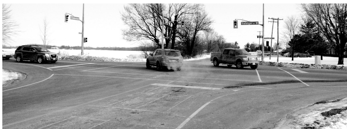
Installation of turn lanes at intersections like this one at Five Sideroad and Trafalgar Rd. are part of the Region's plans for improving safety and reducing congestion on Trafalgar Rd.