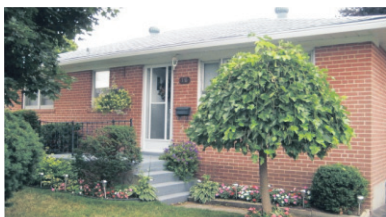
SOLID 2+1 BEDROOM BUNGALOW $306,888