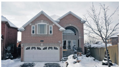
NO DISAPPOINTMENTS HERE! $529,200