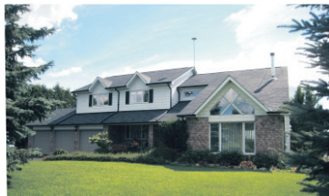
SPECTACULAR ESTATE HOME $995,000