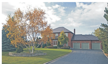
EXCLUSIVE WILDWOOD ESTATES $979,000