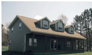
COMPLETELY REFINISHED 4 BDRM $329,000