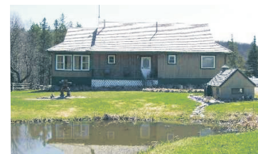
2 + 2 BDRM + WORKSHOP $199,000