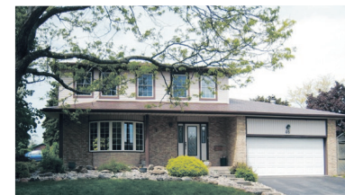
SPACIOUS FAMILY HOME $450,000