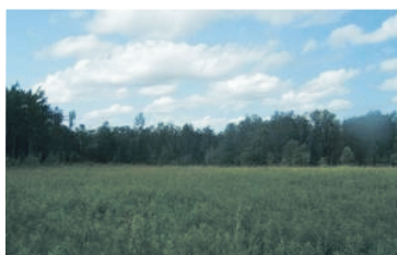
PRETTY & PRIVATE 2.1 ACRE LOT $184,900