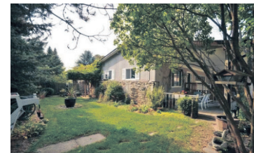
VERY UNIQUE PROPERTY $599,000