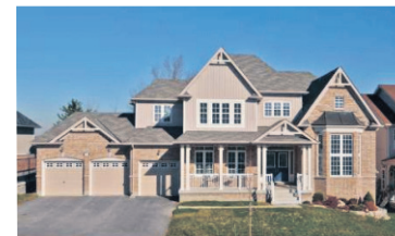
RAVINE IN GLEN WILLIAMS $899,900