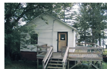
3 BEDROOM COTTAGE $69,000