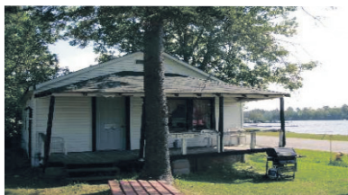
2 BDRM W/EXCELLENT VIEWS OF WILSON LAKE $49,000

Mary Maan*/Emma Fedor* 10-218-30 W2000153