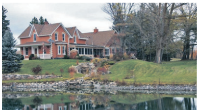
COUNTRY ESTATE WITH 2 PARCELS $3,195,000

Listing details available at: www.johnsonassociates.ca