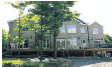
BEAUTIFUL 2 STOREY OPEN CONCEPT $399,000