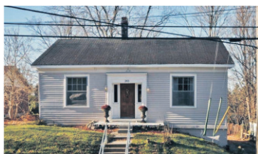
ROCKWOOD CENTURY HOME- www.willsell.ca $239,900