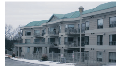
VICTORIA GARDENS PENTHOUSE UNIT $429,000