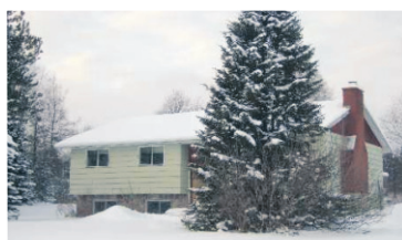
BUNGALOW ON 92 ACRES $189,900