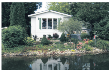
FEELS LIKE A COTTAGE-5MINS TO GUELPH $134,900