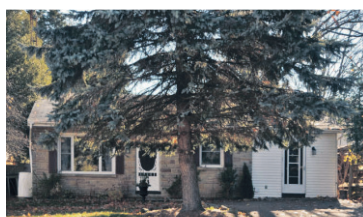
2 BDRM BUNGALOW- www.willsell.ca $284,900