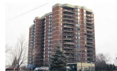
SPACIOUS UPGRADED UNIT O/L RAVINE $89,000