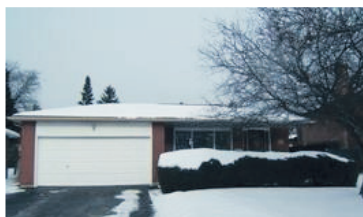
POOL SIZED YARD - BRAMPTON $369,900