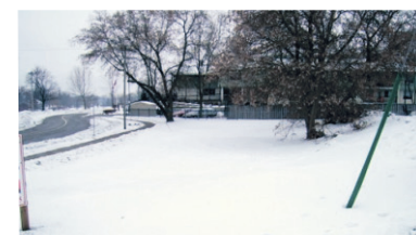
WHAT A DEAL THIS PROPERTY IS! $95,000