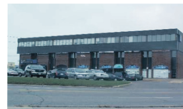
RENTAL UNIT AVAILABLE $13.00/SQ FT