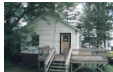
3 BEDROOM COTTAGE $69,000