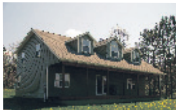
COMPLETELY REFINISHED 4 BDRM $329,000