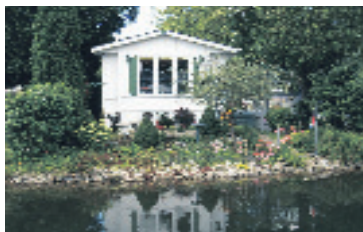
FEELS LIKE A COTTAGE-5MINS TO GUELPH $134,900