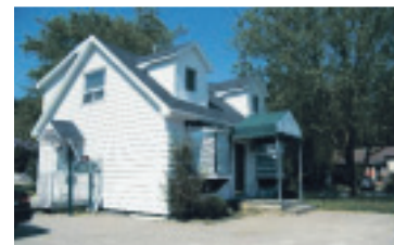
GREAT EXPOSURE FOR YOUR BUSINESS $324,800