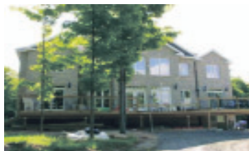
BEAUTIFUL 2 STOREY OPEN CONCEPT $399,000