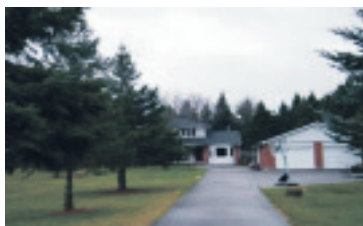
PEACEFUL DREAMING $449,000