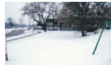
WHAT A DEAL THIS PROPERTY IS! $95,000