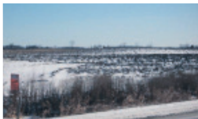
ENJOY THE VIEWS - SUPERB LOCATION $269,000