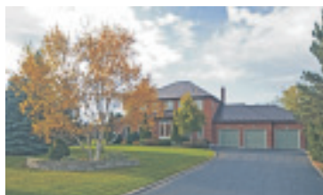
EXCLUSIVE WILDWOOD ESTATES $979,000