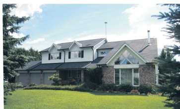
SPECTACULAR ESTATE HOME $995,000