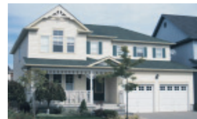
OPEN CONCEPT-WALK TO SCHOOLS & PARKS $444,900