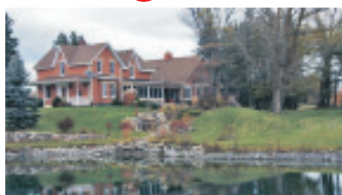
COUNTRY ESTATE WITH 2 PARCELS $3,195,000

Listing details available at: www.johnsonassociates.ca