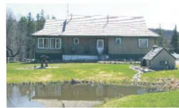
2 + 2 BDRM + WORKSHOP $199,000