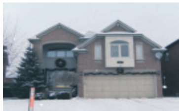
4 BEDROOM BRUNSWICK MODEL $485,000