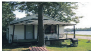
2 BDRM W/EXCELLENT VIEWS OF WILSON LAKE $49,000

Mary Maan*/Emma Fedor* 10-218-30 W2000153