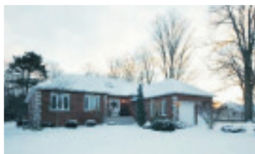
OPPORTUNITY AWAITS IN GLEN WILLIAMS $799,900