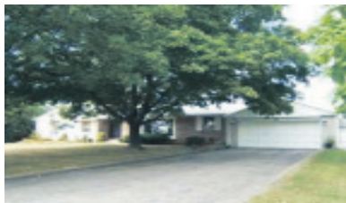
O/LOOKS EAGLE RIDGE GOLF COURSE $557,900