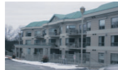
VICTORIA GARDENS PENTHOUSE UNIT $429,000