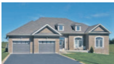
ALMOST NEW-OPEN CONCEPT FLOOR PLAN $554,900