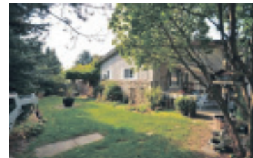
VERY UNIQUE PROPERTY $599,000