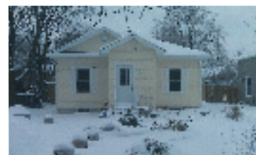
CUTE 2 BDRM STARTER - MOVE-IN READY $329,800