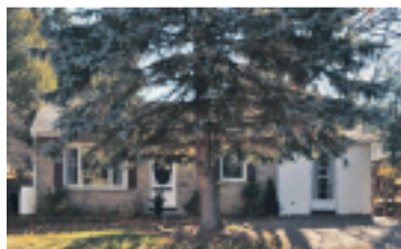
2 BDRM BUNGALOW-www.willsell.ca $284,900